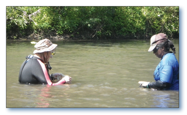
Figure 2. Biologists conduct DNR mussel survey.

and Land Stewardship (IDALS) and the U.S. Department of Agriculture (USDA) Natural Resources Conservation Service (NRCS) and Farm Service Agency (FSA). The project employed a full-time watershed project coordinator to help landowners implement practices in the watershed. Next, the Middle Buffalo Creek Project, funded primarily by WIRB and IDALS, installed conservation practices in the middle portion of Buffalo Creek downstream for approximately one additional year.