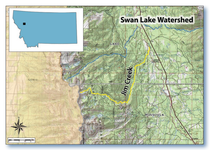
Figure 1. Jim Creek is in the Swan Lake watershed.

Bull trout and grizzly bear, both listed under the Endangered Species Act, are found in the 408,630-acre Swan Lake watershed, which is classified as part of the Northern Rocky Mountain ecoregion.