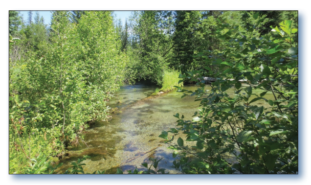
Figure 3. Lower Jim Creek, seen here in 2013, now meets Montana's narrative sediment standard.

With support by CWA section 319 and state and local match funding, SVC has reported a sediment reduction of 159 tons per year in the Swan Lake watershed. Additionally, the Montana Department of Transportation has decreased their application of traction sand along 47 miles of state highway 83 through the Swan Valley, from about 500 pounds to