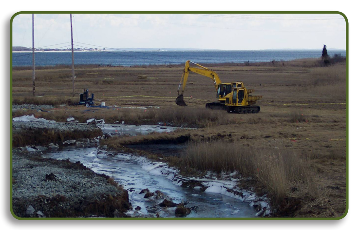
Salt Marsh Excavation

» Phase III activities included excavating a total of 36,400 cy of contaminated marsh and creek bed sediment at Boys Creek and restoring these areas as well as the entire site. Based on analytical results, the contaminated sediment was disposed of at nonhazardous waste landfills. The marsh restoration began in May 2007, and construction was completed in September 2007. The cost of this cleanup phase was about $6.5 million. Monitored natural attenuation for the groundwater is under way.