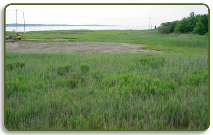
Atlas Tack Revitalization