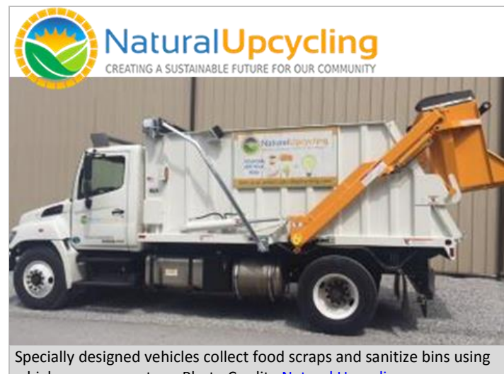
a high-pressure system.

The digester at Noblehurst Green Energy, which is next to the Noblehurst Farms dairy complex, uses food waste and scraps to increase their biogas yield and boost electricity generation. In March 2014, Noblehurst founded the company Natural Upcyling to collect source-separated organics. Food waste and scraps are collected from local educational institutions (Rochester Institute of Technology and Hobart and William Smith Colleges), restaurants (Chipotle and Gimme! Coffee), schools, a local creamery processing plant, consumer food manufacturing companies (Rich's and WhiteWave Foods), and more than 30 Wegmans Food Markets stores. Since then, Natural Upcycling has become a premier food scraps and organics recycling collection company.