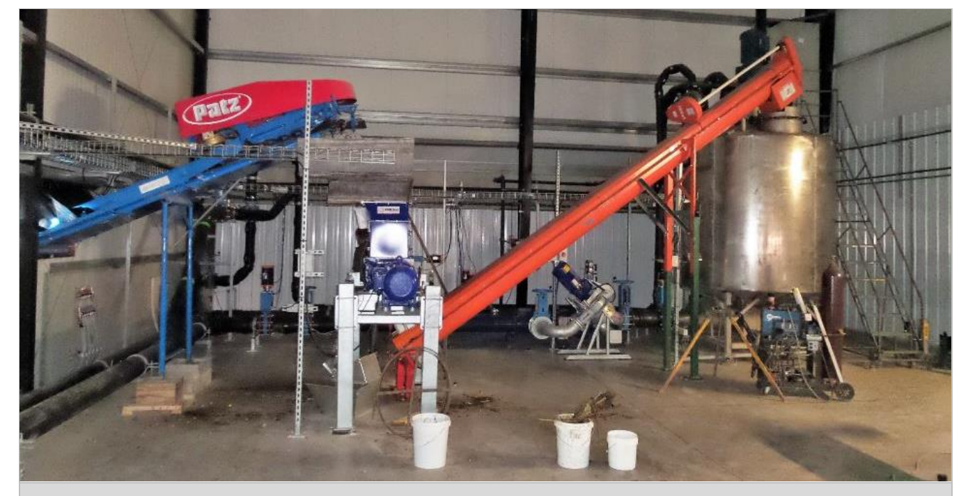
A Patz gutter cleaner conveys solid food waste into a grinder which then meters the waste into a stainless-steel vat where it is mixed with liquid manure and other liquid substrates. After mixing, the material is pumped into the digester.

The waste streams are co-digested within the anaerobic digester, producing biogas that is captured and used to generate electricity, heat, and hot water. Hydrogen sulfide is scrubbed from the biogas within the anaerobic digester by injecting ambient air into the headspace of the digester. After hydrogen sulfide abatement, the biogas cools as it is pumped to a combustion engine. Condensate from the cooled gas is collected using a sump. The biogas fuels a 500-kilowatt (kW) generator that produces electricity that is net metered and is enough to power Noblehurst Farms and the nearby Craigs Station Creamery milk plant. Heat is also captured and used to heat the digester and associated rooms, as well as to heat water at the milk processing plant.