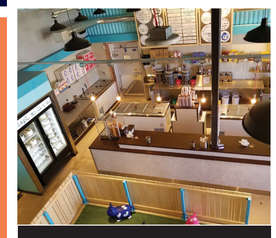
The Stanley Marketplace offers a variety of food and drink options, such as shops with ice cream, breakfast and sandwiches, and wine and spirits.