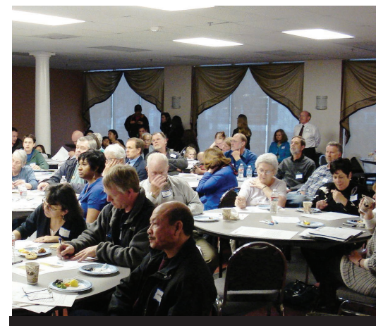
Community meetings were held as part of a brownfields area-wide planning process for the former Stanley property.