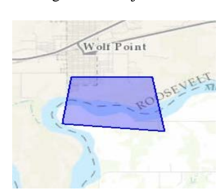
Figure 3 – Project Area

The U. S. Fish and Wildlife Information for Planning and Conservation (IPaC) website program was utilized to determine federally-listed Endangered, Threatened, Proposed and Candidate Species for the area of the WWTF. The IPaC Trust Resource Report findings are provided below for the Wolf Point WWTF site. The designated area utilized was taken directly from the IPaC system and covers the area of the WWTF and adjacent Missouri River on the Fort Peck Indian Reservation in Roosevelt County, Montana.