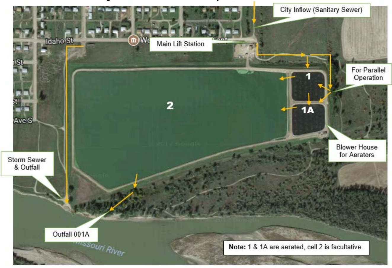
Figure 1. Aerial view of Facility and flow schematic