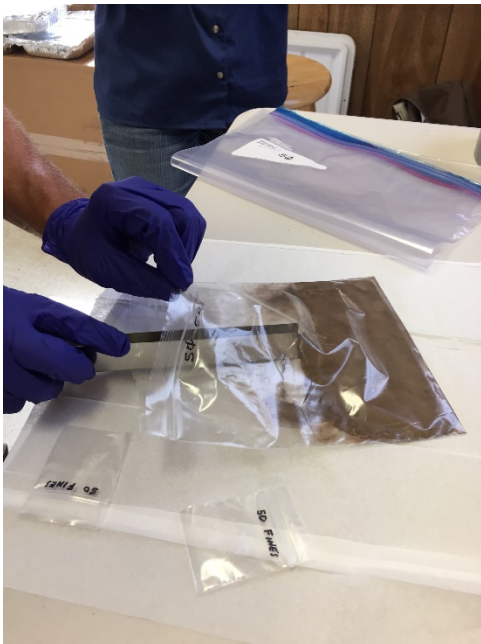
Subsamples taken from the parent fines soil sample.