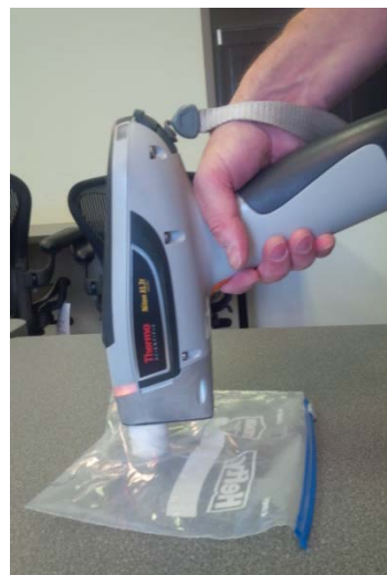
Figure 4: Reading standard with bag.

It is recommended using a manufacturer-supplied stand (see Appendix E) when possible and to maintain a ¼" thickness of soil to avoid interference from outside sources.