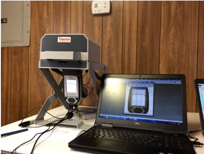
XRF stand connected to the computer with XRF screen replicated.