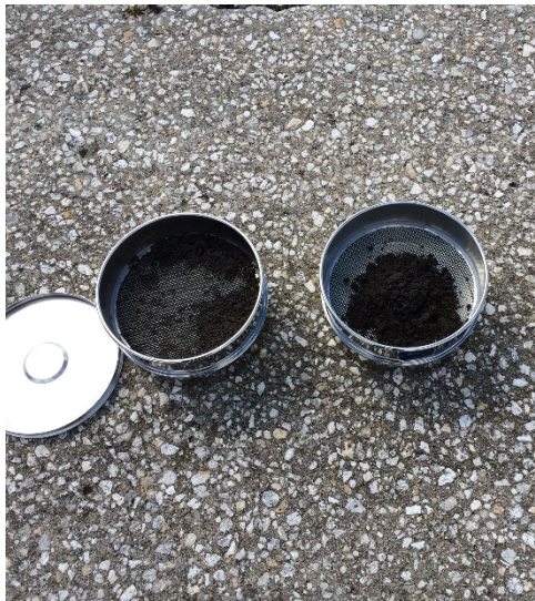
Soil samples being dried alternatively by Florida's sunshine.