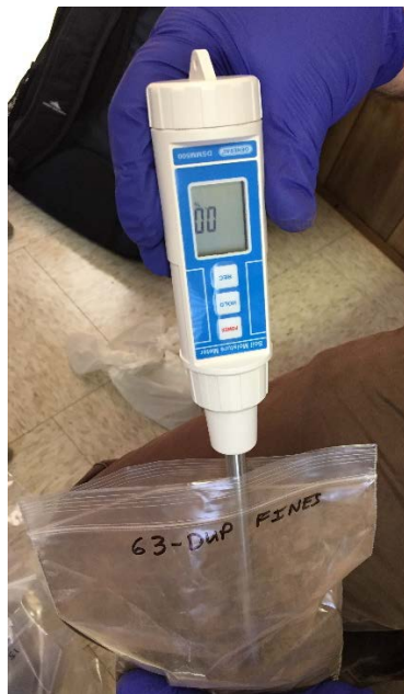
Figure 1: Obtaining a moisture reading using General Tools DSMM500 Precision Digital Soil Moisture Meter.