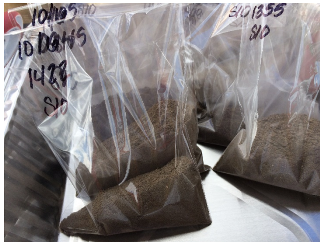
Sieved soil samples properly labeled and waiting XRF coarse readings.