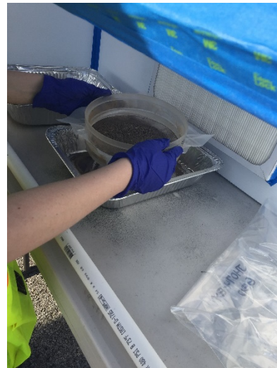
Soil samples being sieved under a fume hood.