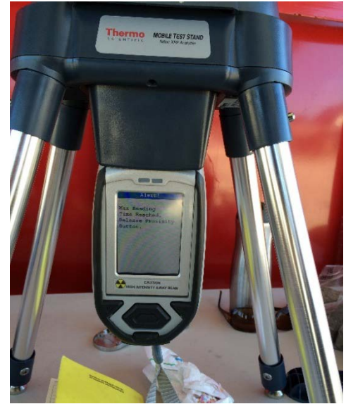
XRF stand with XRF attached.