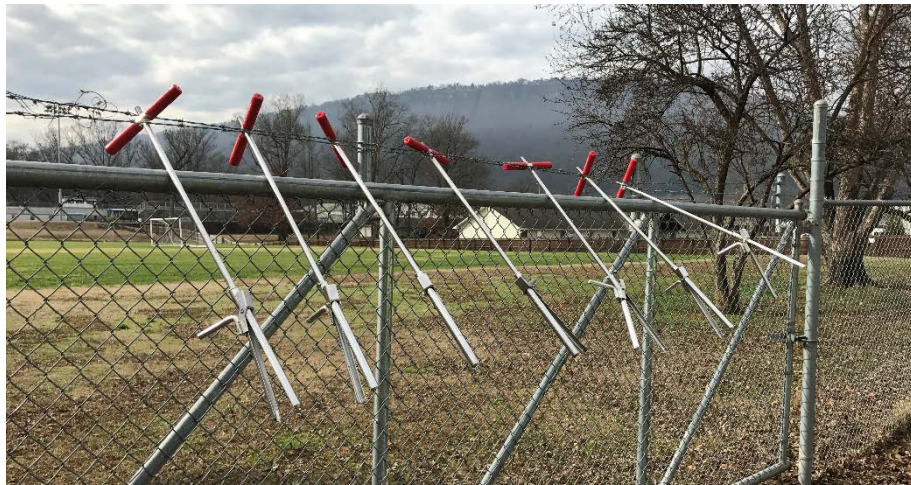
Surface soil samples drying after decontamination process.