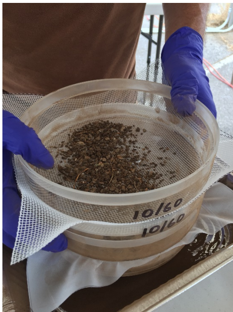
Stacked disposable sieves capturing the fraction