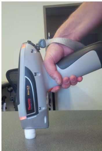
Figure 3: Reading standard without bag.

Any items, including clear, plastic bags located between the instrument and the sample may interfere with the XRF reading. Therefore, plastic bags need to be tested, as seen in Figures 3 and 4, to ensure they do not interfere with the analytical results (Crumbing). Each lot of plastic bags should be tested because the manufacturing process may differ slightly with each lot. SSS found that colored or tinted bags have a tendency to cause interference. The Bag Test Spreadsheet (Figure 5) will calculate the degree to which the bag interferes with the results. If the spreadsheet shows the plastic bag lot is within acceptable limits, all bags with that manufacturer's lot number can be used. The manufacturer lot number is typically found on the box (Figure 6). If the degree of interference (use the Bag Test Spreadsheet tool) from the bag is determined to be outside of acceptable limits, all bags with that lot number should not be used.