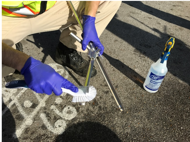
Decontamination of surface soil samplers.