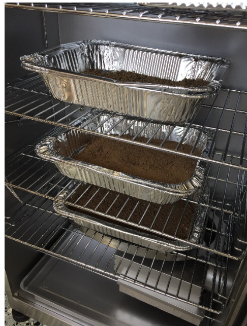
Drying ovens with soil samples inside (above)