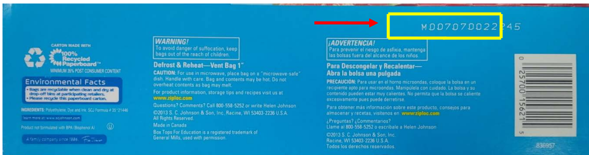
Figure 6: Lot number on upper right corner of plastic bags box.