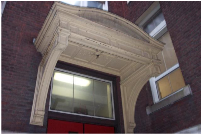
Figure A-10. Awning prior to work

Two workers removed paint from an exterior awning above a doorway outside a school using heat guns above 1100 degrees Fahrenheit. The awning is located in the same courtyard as the other two exterior jobs at the school that is surrounded on three sides by 3-story brick walls. The awning extends about 4 feet from the wall above the doorway. Paint was removed from trim, the ceiling, and the ornate painted supports. Work was halted after approximately five hours of paint removal work even though only about 30 ft<sup>2</sup> of surface area was worked on.