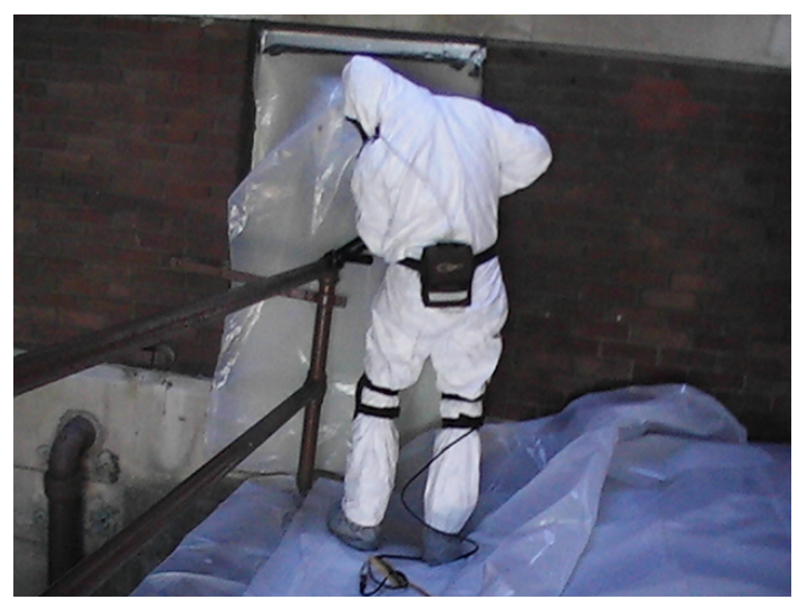
Figure A-8. Removing paint from railing

The workers removed deteriorated paint from a metal railing outside a school using a needle gun tool. The railing, located in a courtyard surrounded on three sides by 3-story brick walls, extended about 20 feet from the wall opposite the opening. The railing is set in concrete raised about 1 foot off the ground. One side of the raised concrete was a drop to a set of stairs and a patio about six feet below the base of the railing. The paint removal work took approximately 4 hours to complete.