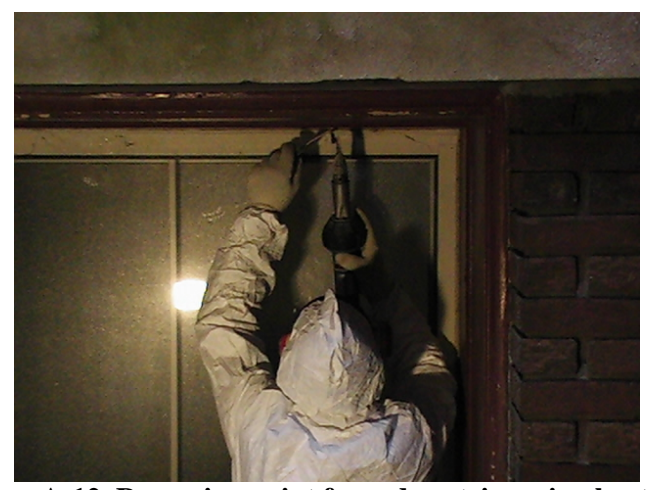
Figure A-12. Removing paint from door trim using heat gun

The workers removed paint from all flat surfaces on an exterior door and door casing using heat guns operated at about 1000 degrees Fahrenheit. The door, which opens into the ground level of a closed school, was located at the bottom of a set of stairs. Small areas of paint remained door panels and curved sections of door casing. It took approximately 1 hour and 20 minutes to set up the containment area and 4 hours to complete the paint removal.