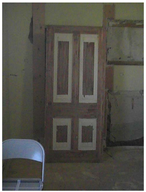
Figure A-2. Door with paint removed

Approximately two linear inches of paint along all inside edges of the door panels (four per door) could not be removed, due to the size and configuration of the planer. Although door planing was classified as a medium level interior job, the process generated tremendous amounts of dust, which settled on all visible surfaces of the Work Room. An off-duty Columbus police officer was present.