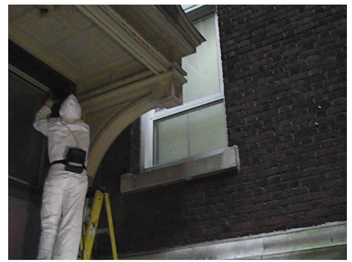
Figure A-11. Removing paint from awning using heat gun