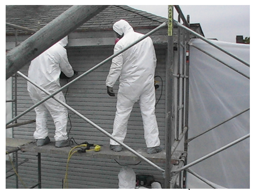
Figure A-7. Power grinding paint from 2<sup>nd</sup> story wall

The workers removed deteriorated paint from 100 ft<sup>2</sup> on a 2-story section of wall at a single family home using power grinders that used metal disks rather than sandpaper. The north wall that they removed paint from was about 20 feet high. The scraping generated a large amount of paint chips and dust throughout the entire containment zone. It took approximately 2 hours to complete the paint removal.