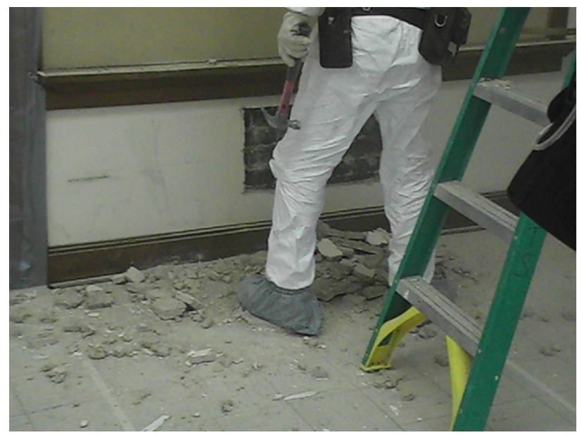
Figure A-1. Wall cut out at school