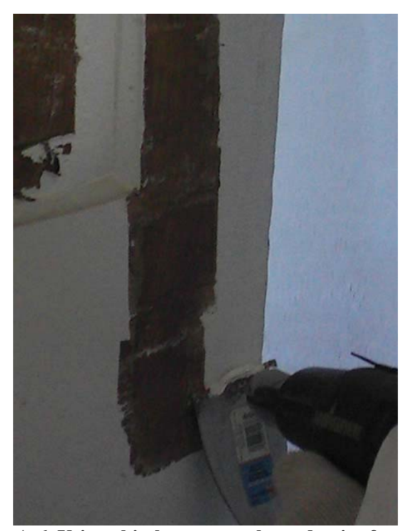
Figure A-6. Using chisel to remove heated paint from door

Approximately 53 ft<sup>2</sup> of paint was removed from the baseboards, window trim, fireplace, and door trim of a second floor bedroom using two heat guns operating at temperatures above 1100°F.