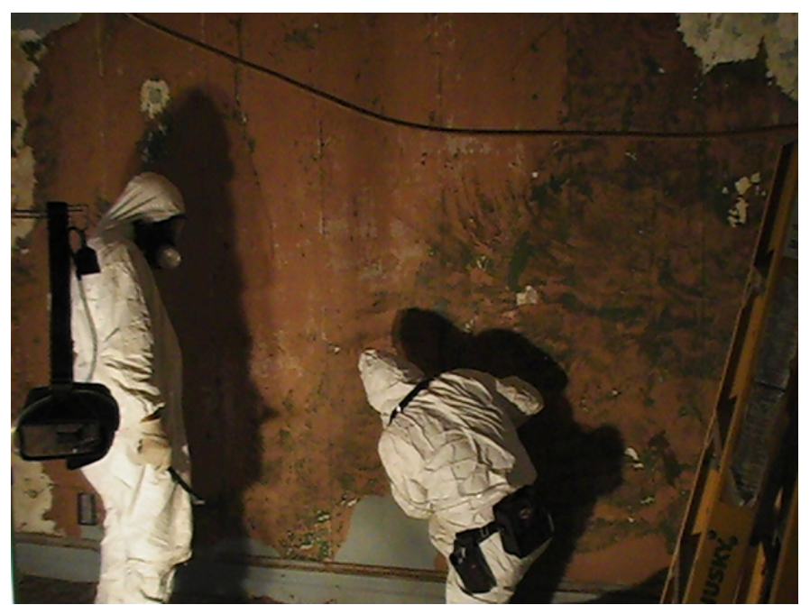
Figure A-4. Dry scraping paint from wall

Paint was removed from one wall of a second floor room. Using dry scraping tools, deteriorated paint was removed in preparation for repainting, but not all paint was removed down to the plaster, if intact.