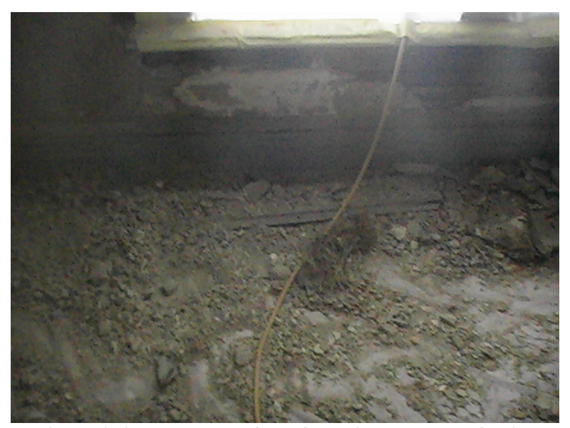
Figure A-3. Work room floor following removal of paint

of the length of time required to perform the work, the post-cleaning wait time was skipped. An off-duty Columbus police officer was present.