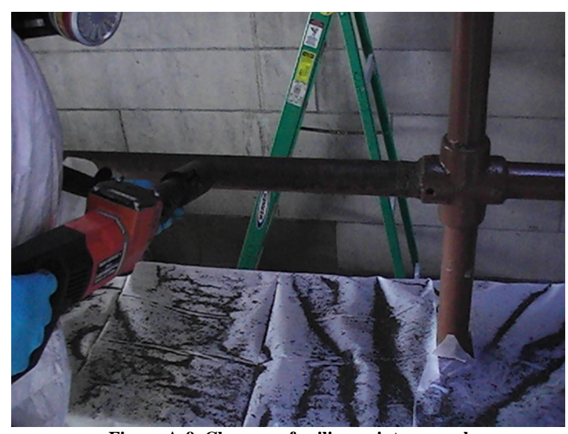
Figure A-9. Close-up of railing paint removal