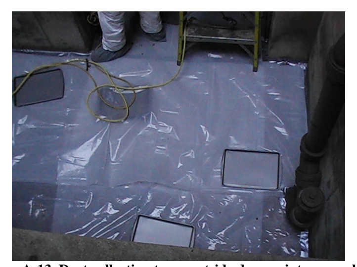
Figure A-13. Dust collection trays outside door paint removal job