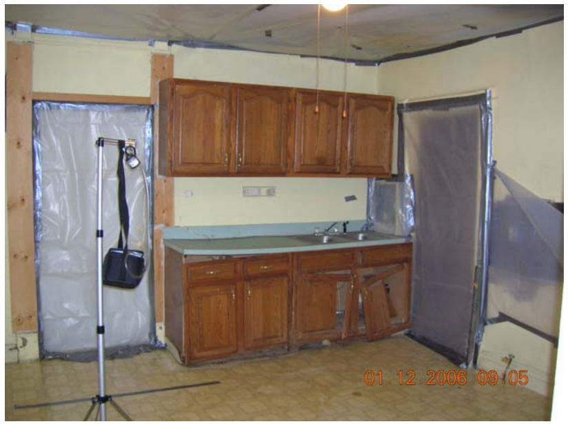
Figure A-5. Kitchen cabinets prior to removal

The job included the removal of a counter top, sink and cabinets from a first floor kitchen.