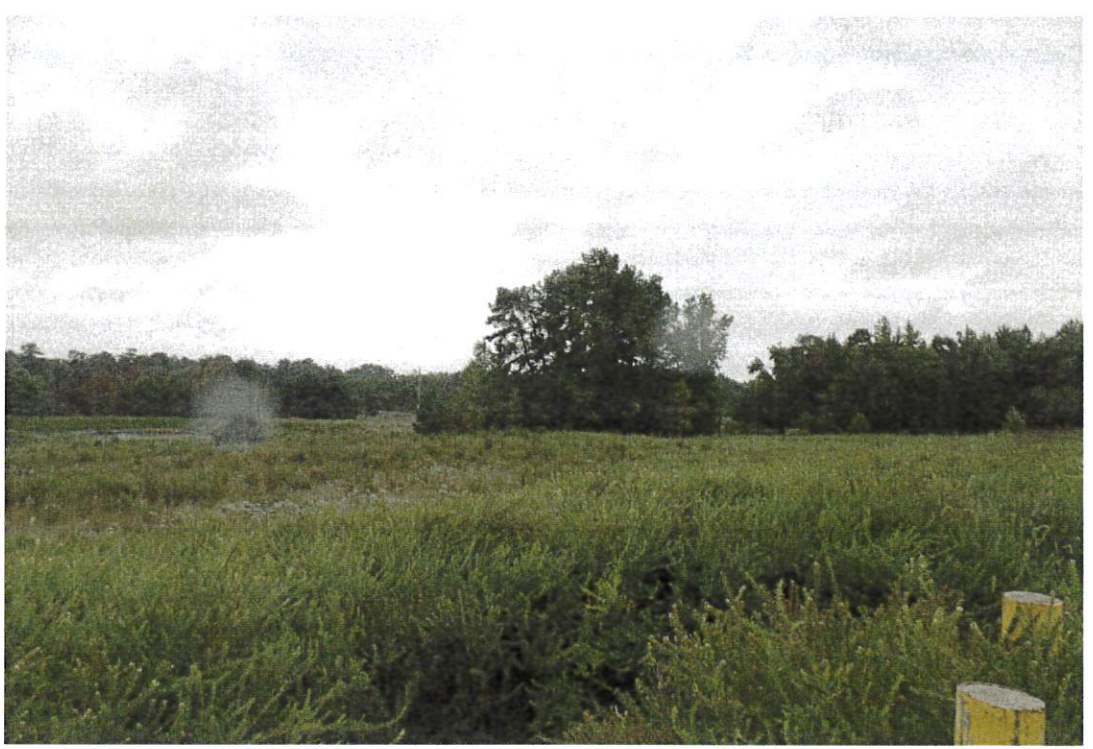
Looking south toward ash landfill along GMZ for SWMU 7/12/13