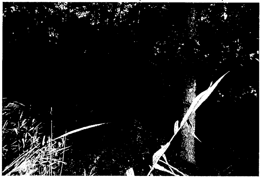
A view into woods east of landfill of covered exposed waste from SWMU 13/17