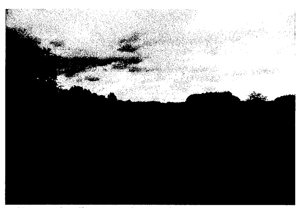
Looking across the golf course, a no dig area in the UECA covenant