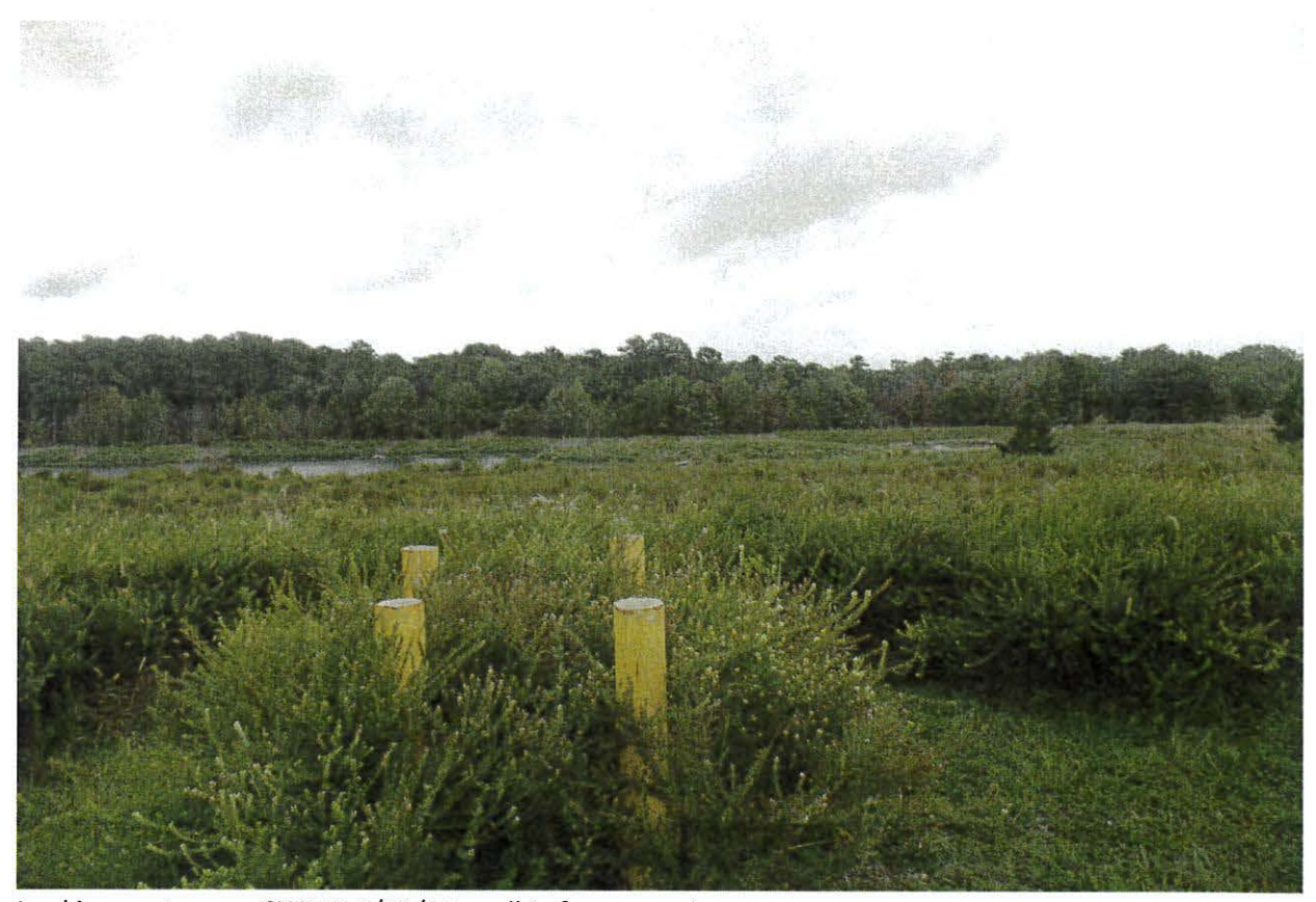
Looking east across SWMU 7/12/13, well in foreground

CONCLUSIONS AND RECCOMENDATIONS: INVISTA is in compliance with the ROD and all associated controls at the site. A letter of compliance in recommended.