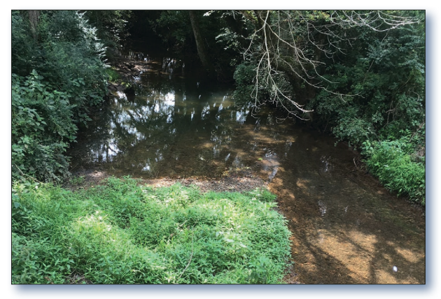
Figure 2. Habitat conditions in Skillern Creek, seen here in July 2017, have improved.

(Figure 2). The creek continues to be listed for E. coli from pasture grazing. Restoration work by the SETN RC&D, the Bledsoe County SCD, and others is ongoing.