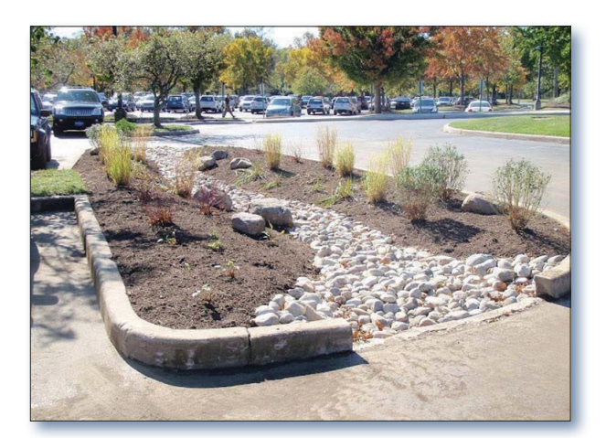
Figure 2. Completed rain garden at Subaru of America in Cherry Hill, New Jersey.

partners such as Rutgers Cooperative Extension Water Resources Program, Rutgers Cooperative Extension of Camden County, and extensive volunteer effort, began implementing the plan in 2007. To date, approximately 42 rain gardens, 14 stormwater basin retrofits, a stream bank restoration, a floating island pond treatment unit, a biofilter wetland and a buffer restoration have been implemented (Figure 2). Partners constructed most of these projects on public lands: schools, parks, community centers or within the median of municipal roadways. However, several demonstration rain gardens were constructed on commercial properties. In addition, partners implemented extensive education efforts to raise awareness about