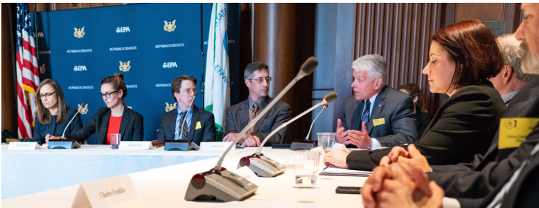
Listening to Smart Sectors partner feedback at the Administrator roundtable in June 2018.