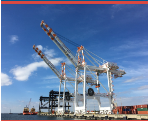
Site visit to Port Tampa Bay, FL in March, 2018.