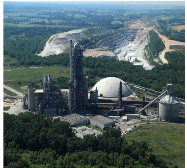
Site visit to Lehigh Hanson cement plant in Union Bridge, Maryland in September, 2018.

The Smart Sectors program staff visited the following sites to learn more about sector operations: Chevron Phillips Chemical Company plant in Lake Jackson, TX; Port of Cleveland and ArcelorMittal iron and steel facility in Cleveland, OH; Empire Dairy in Wiggins, CO; JBS/Five Rivers Cattle Feeding in Kersey, CO; Port of Virginia in Norfolk, VA; Marathon Petroleum Corporation's Catlettsburg Refinery in Catlettsburg, KY; Empire State Building energy efficiency retrofit and Hudson Yards sites in New York City; The Boeing Company in Charleston, SC; FoodMaven in Colorado Springs, CO; Port Tampa Bay in Tampa, FL and Mosaic Four Corners Mine in Bradley, FL; Zentech Manufacturing electronics facility in Windsor Mill, MD; Donjon Shipbuilding and Repair in Erie, PA; Fair Oaks Farms in Fair Oaks, IN; and Lehigh Hanson cement plant in Union Bridge, MD.