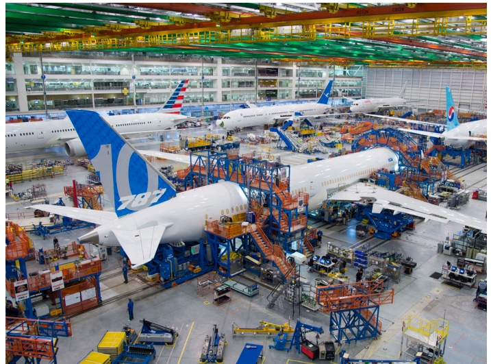
Site visit to The Boeing Company, Charleston, SC facility in March, 2018.

Smart Sectors also supports the Regulatory Reform Task Force , that was established in 2017, as directed by Executive Order 13777, to evaluate existing regulations and make recommendations on those that may be appropriate for repeal, replacement, or modification. EO 13777 also directed agencies to seek input from entities significantly affected by regulations. Outreach since 2017, including through Smart Sectors, has continued to bring additional regulatory reform opportunities to EPA's attention. The program will continue to play a supporting role with