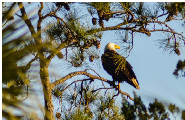
Maintaining and improving the Cooper Watershed is critical for the health of the diverse ecosystem in Charleston, SC.

respect to passing along recommendations that have been communicated by sector partners for appropriate program office consideration and potential development, in accordance with internal processes and in conformance with the Administrative Procedure Act and other applicable laws.