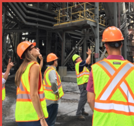
Site visit to Lehigh Hanson cement plant in Union Bridge, MD in September, 2018.