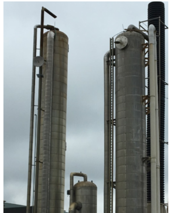
Site visit to Fair Oaks Farms in Fair Oaks, IN, in September, 2018. The anaerobic digesters convert manure into biogas that is then refined into compressed natural gas (CNG) to fuel the milk trucks and to generate electricity to power the farm buildings and machines. Surplus clean biogas is piped and sold to a CNG fueling station.