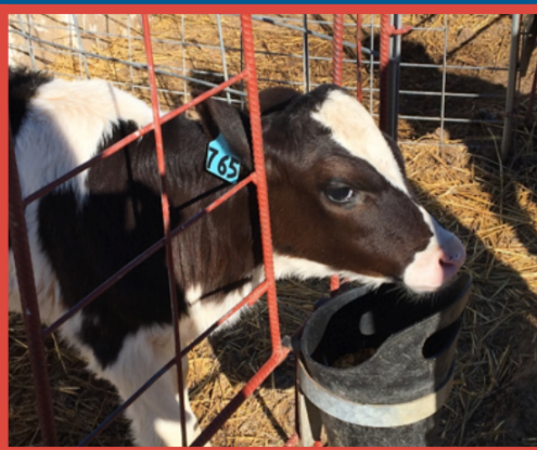
Site visit to Empire Dairy in Wiggins, CO in October, 2017.

On October 3, 2017, EPA launched Smart Sectors, a partnership program that provides a platform to collaborate with regulated sectors and develop sensible approaches that better protect the environment and public health. The goals of the program include: meaningful collaboration with regulated sectors; sensible policies to improve environmental outcomes; and better EPA practices and streamlined operations.