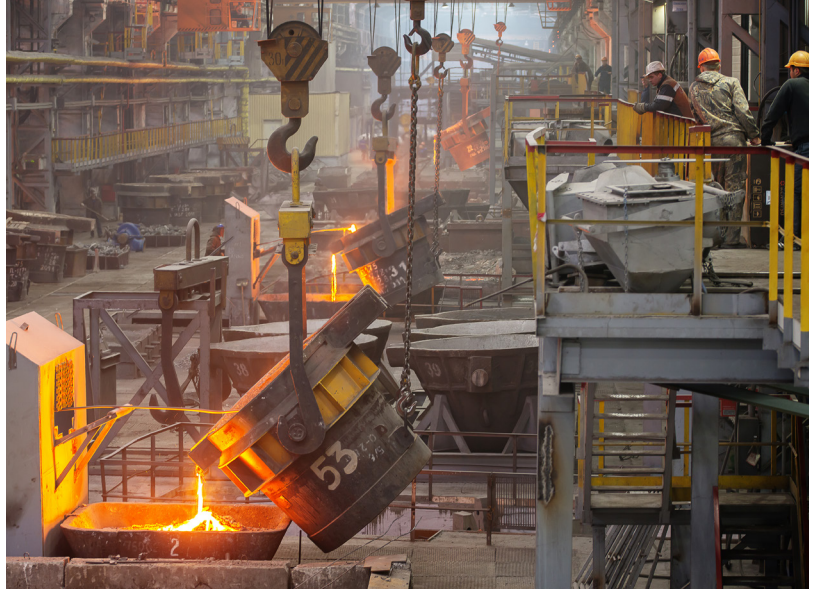
An electric arc furnace used in industrial steel making.

The program unveiled a new sector snapshots tool in September 2018 that provides environmental and economic data about three industries participating in the program. This interactive, web-based application employs a novel approach by assembling a range of environmental and economic data from different publicly-available sources to provide an integrated, easy-to-understand context for each sector over the last 20 years . Each snapshot is designed to help the general public, EPA, and sector partners gain a common understanding of sector performance to inform environmental improvement strategies going forward. The first snapshots feature the chemical manufacturing, iron and steel, and utilities and power generation sectors. Well over 100 different chart views are possible for each snapshot, depending on which combinations of indicators, benchmarks, and events are selected. Snapshots for the remaining sectors will be released in batches over the next year.