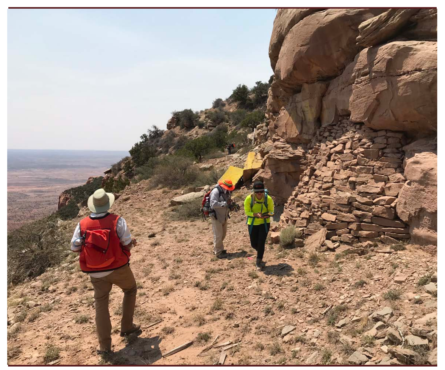
Navajo Area Uranium Mines