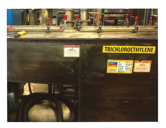
OLD TCE Strip Cleaning Wash Box