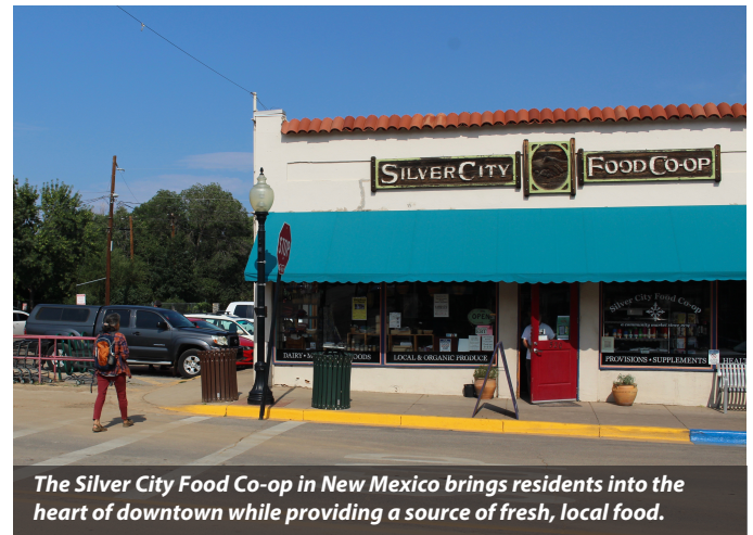
The Silver City Food Co-op in New Mexico brings residents into the heart of downtown while providing a source of fresh, local food.