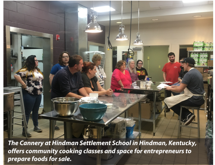
The Cannery at Hindman Settlement School in Hindman, Kentucky, offers community cooking classes and space for entrepreneurs to prepare foods for sale.

The Jefferson County Soil and Water Conservation District sought assistance to help coordinate multiple revitalization and food security initiatives in a densely populated, demographically diverse area of downtown Louisville, Kentucky , that suffers from high poverty and unemployment, the recent closure of its grocery stores, and a significant number of abandoned and vacant properties. The planning incorporated strategies to improve the physical environment in ways that support walking and biking, reduce heat island effects, reduce flooding, and increase safety.