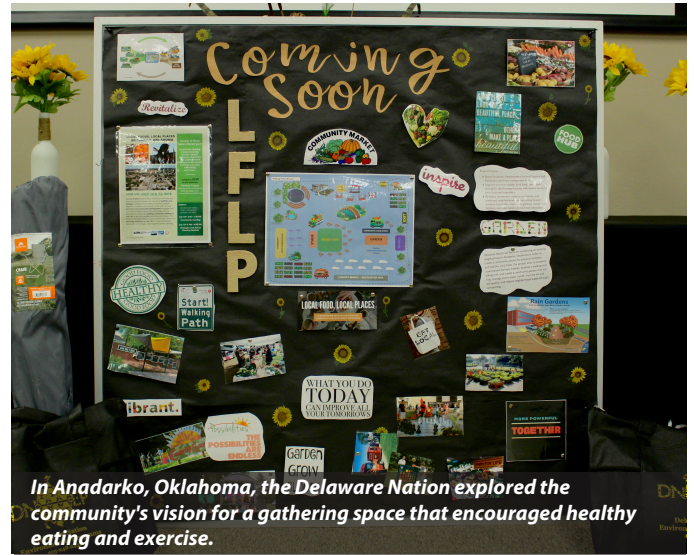
In Anadarko, Oklahoma, the Delaware Nation explored the community's vision for a gathering space that encouraged healthy eating and exercise.

The city of McCroy, Arkansas , created a plan to comprehensively address barriers to good nutrition and physical activity by planning for a thriving farmers market that improves access to healthy, local foods; a central gathering place that anchors Main Street; walkable and bikeable streets that connect community assets and healthy places; and a strong local food economy.