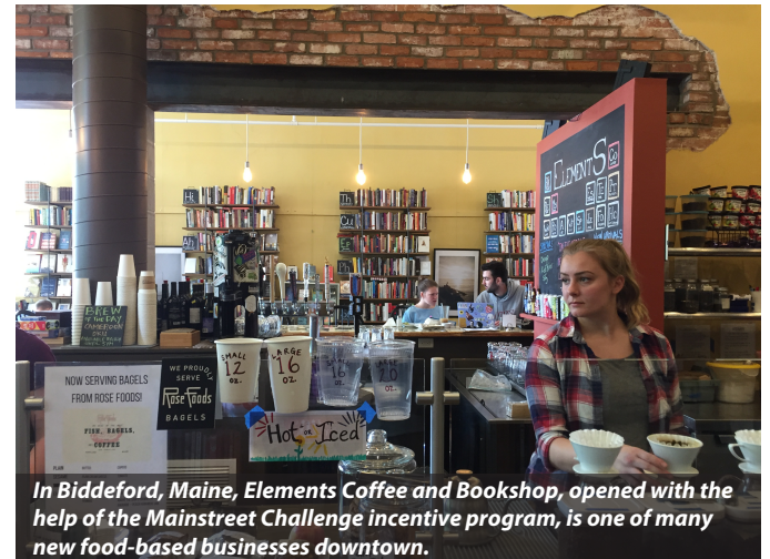
In Biddeford, Maine, Elements Coffee and Bookshop, opened with the help of the Mainstreet Challenge incentive program, is one of many new food-based businesses downtown.

Engine, a nonprofit organization in Biddeford, Maine , planned for the redevelopment of a vacant Main Street building, made possible through a brownfields cleanup grant, to support revitalization of the historic Main Street and Mill District. The action plan includes strategies to improve access to healthy, fresh food and strengthen community engagement with events and initiatives that connect food and place downtown.