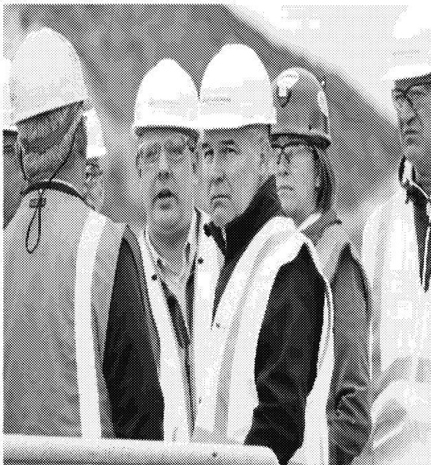
SIERRA CLUB PHOTOGRAPHY

SUNNY 47 • 24 FORECAST 42 | TUESDAY, FEBRUARY 6, 2018 | elkodaily.com