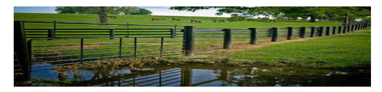
Farm, Lexington, Kentucky