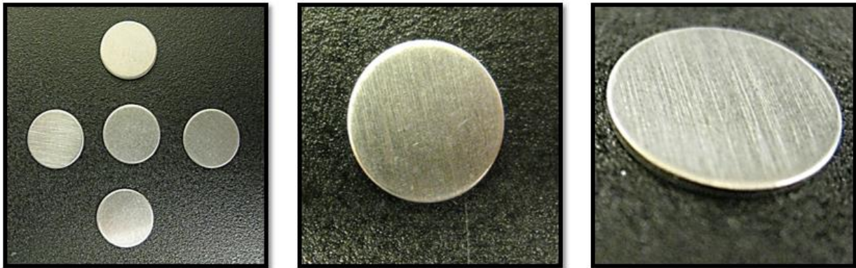
Fig. 1: Examples of typical acceptable 430 SS carriers.