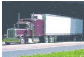
Heavy-duty trucks & buses