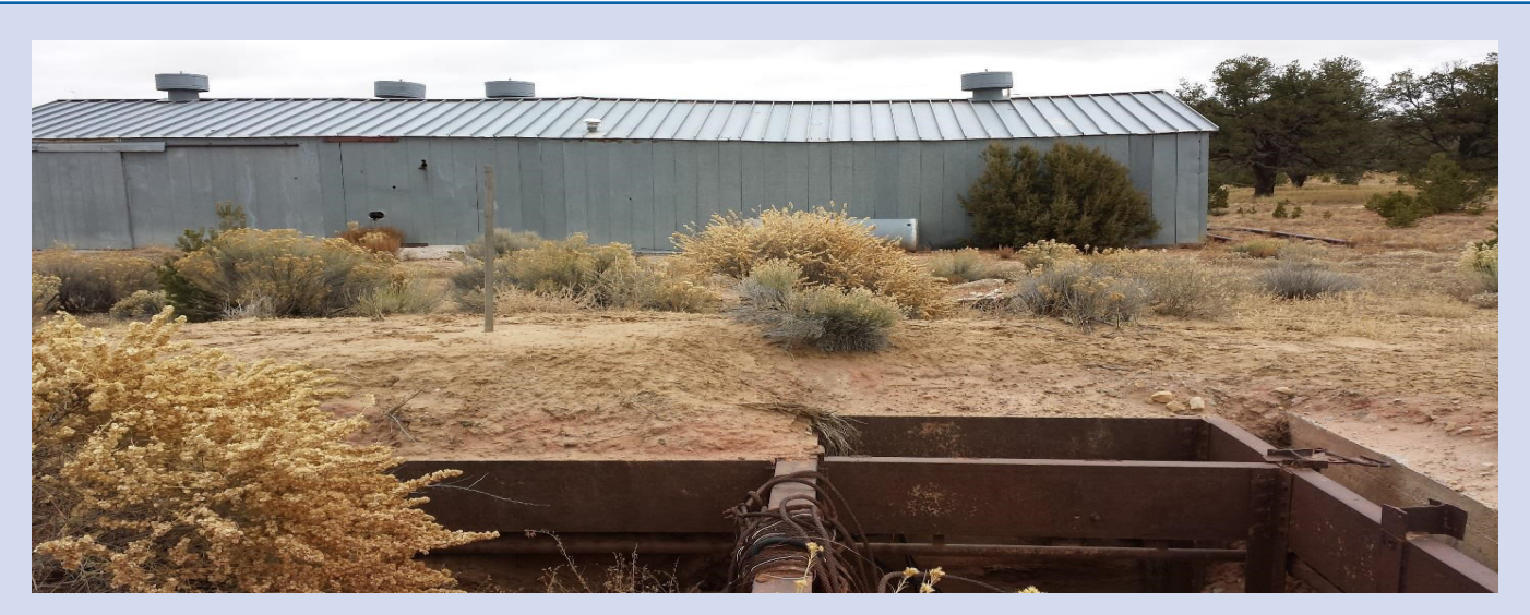
Old mining building at Black Jack #2