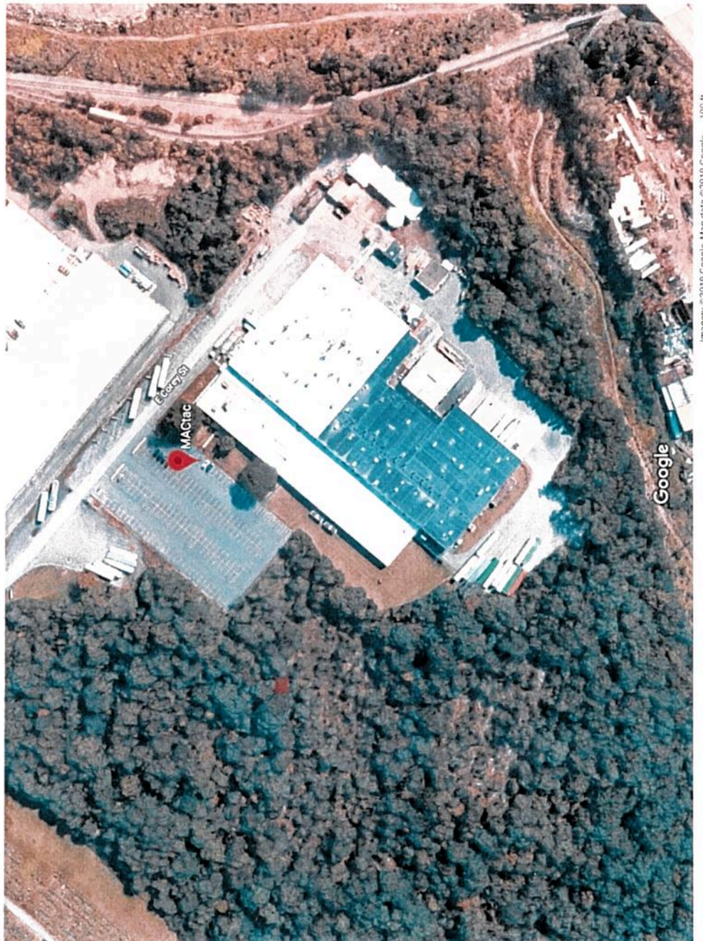
Figure 1: Map of Facility