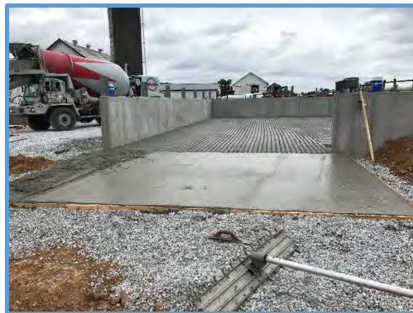
New concrete manure storage structure on the Kauffman farm in Honey Brook, PA.