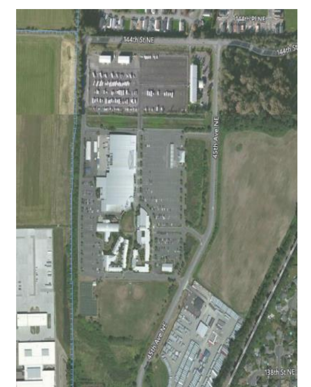
Figure 3: Detail of Naval Support Complex Smokey Point