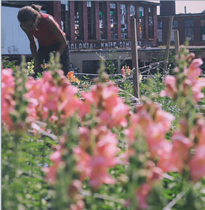
What Cheer Flower Farm.

EPA Funding Provided to States and Tribes to Address Contaminated Land in their Communities