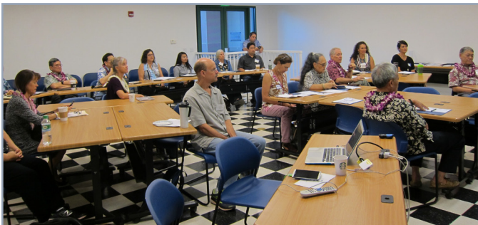
2018 first County of Maui brownfields redevelopment workshop.

YANKTON SIOUX TRIBE – The Yankton Sioux Tribe is completing the cleanup of the Old Tribal Hall in Marty, South Dakota. Historically, the building was the St. Paul's Parish Mother, and more recently as administrative offices for the Tribe. In 2016, EPA Region 8 performed a Targeted Brownfields Assessment on the abandoned two-story building. The assessment concluded that there was asbestos in the floor tiles, pipefittings and window caulking. On December 24, 2016, the building burned down, leaving a shell of a building with the threat of an asbestos release. The Tribe installed fencing and signage to limit access and exposure to the contamination. EPA Region 8 deployed an Emergency Response team in spring 2017 to conduct a removal assessment. The Tribe used Section 128(a) Response Program funding and worked in conjunction with Indian Health Services and Regional EPA programs (solid waste, brownfields, and the tribal assistance) to select a contractor to conduct cleanup activities at the property. The cleanup activities are anticipated to be completed in 2019.