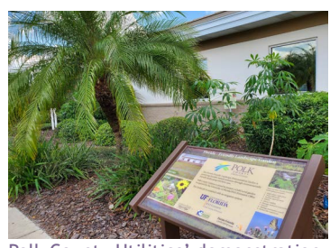
Polk County Utilities' demonstration water-smart garden.

Polk County Utilities spread the word about the importance of water conservation and earned its first WaterSense Excellence in Education and Outreach Award. Polk County invited WaterSense "spokesgallon" Flo to the 7 Rivers Water Festival, encouraging attendees to take photos with her and post them to social media. The utility also had a water conservation wheel, where festival-goers answered questions to get a chance to spin and win prizes. Polk County held a water conservation calendar art contest for K-12 students and distributed 5,000 calendars with the WaterSense logo. In 2018, its demonstration garden, which is featured in the WaterSense Landscape Photo Gallery, won the Florida-Friendly Landscape Gold Level Status award for its low-maintenance design that doesn't