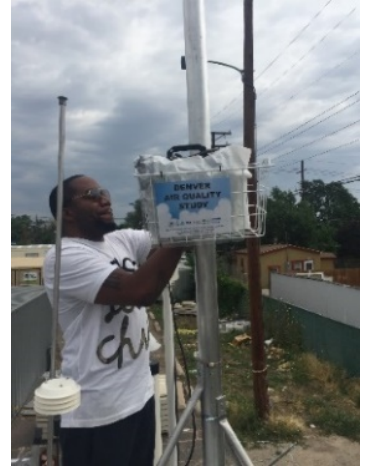
Figure 2: Groundwork Denver community members deploying and retrieving particulate matter (PM) air pollution monitors.

In FY 2019, ORD grantees awarded under the Air Monitoring for Communities RFA worked in collaboration with Region 8 to learn how communities can use low-cost air quality monitors to understand their exposure to air pollution and support the ability of communities to make informed decisions through effective knowledge translation about air quality. Participants are receiving data about their exposure to both indoor and outdoor air pollution, and various data outputs, formats and coaching support are being evaluated for their effectiveness in supporting behavioral modifications to decrease exposure to air pollutants. The ambient monitoring portion of this project is providing