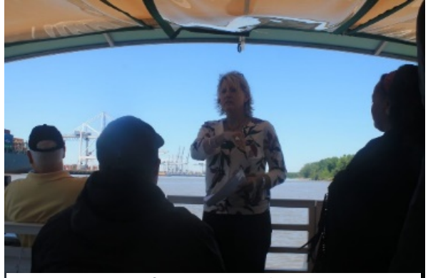
Figure 1: Boat tour of port in Savannah, Georgia.

EPA's Office of Air and Radiation (OAR), in partnership with OEJ and Regional Offices, continued to deliver on-site technical assistance services to ultimately enhance environmental performance of ports and to improve environmental conditions for nearby communities during FY 2019. Under this partnership, the <a href="Near-port Community">Near-port Community</a> Capacity Building Project marked another significant milestone in FY 2019 as closing activities were conducted for pilot projects located in four U.S. cities: New Orleans, Louisiana; Savannah, Georgia; Seattle, Washington; and Providence, Rhode Island.