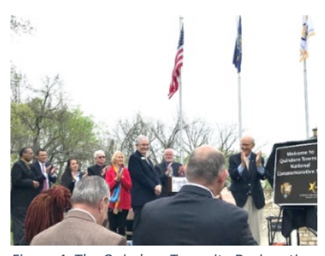
Figure 4: The Quindaro Townsite Designation Ceremony.

EPA and the National Park Service (NPS) have partnered with local community organizations on the Quindaro Townsite (also known as the Quindaro Ruins Underground Railroad site). NPS designated the Quindaro Townsite as a national commemorative site after more than 20 years of advocacy by local champions in Kansas City, Kansas. The site is one of the largest underground railroad sites in the country. The designation was celebrated in FY 2019 by the community along with local, state, and federal officials. NPS will fund the site improvements and Region 7 EJ and Brownfields staff are currently assisting with redevelopment planning and site assessment work.