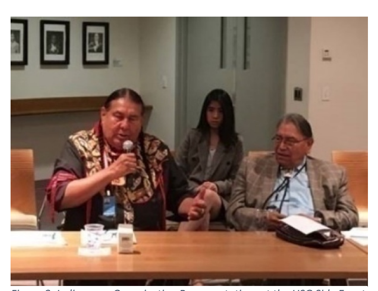
Figure 8: Indigenous Organization Representatives at the USG Side Event on Traditional Knowledge.

The U.S. Government (USG) Delegation for the <u>United Nations 2019 Permanent Forum on Indigenous</u> <u>Issues</u><sup>47</sup>(UNPFII) consisted of representatives from the Advisory Council on Historic Preservation (ACHP), U.S. Department of State, U.S. Department of Agriculture/Forest Service (FS), U.S. Agency for International Development and EPA. The USG participated in the plenary sessions held April 22 – 25, and several of the UNPFII <u>side events</u><sup>48</sup>. The USG prepared two official statements for the UNPFII. One statement was on indigenous languages, the focus of the first day. The second statement was on Traditional Knowledge<sup>49</sup> (TK), which was the primary theme of the 2019 UNPFII. The USG