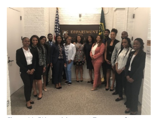
Figure 11: EJA participants at Tennessee State University.

The EJA is the premier leadership development program and curriculum for EJ community leaders. The EJA launched its first class in September 2015 with 26 participants. The 2<sup>nd</sup> year EJA class began in September 2016 and graduated 15 students in April 2017. In FY 2019, the EJA graduated 20 students in two separate classes. Both classes participated in a pilot-modified approach, which included three days of classroom instruction, five homework webinars, and capstone presentations. The original 9-month EJA curriculum provided training on a range of topics and incorporated established methods and principles, including the following: