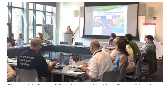
Figure 14: Port-of Providence Working Group Meeting.

EPA provided technical assistance through a Technical Assistance Services for Communities (TASC) contract to the Environmental Justice League of Rhode Island (EJLRI) to help build community capacity to address air-quality concerns and impacts to public health around the Port of Providence. After three stakeholder meetings in 2018-19 led by EPA, a "Port-Community Working Group" was formed to steer future collaboration. The group includes diverse representation of community, businesses, and state/local agency partners, and meets quarterly to identify goals, opportunities, and resources to help "green" port