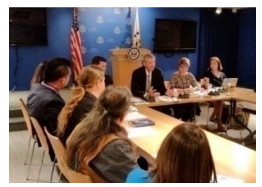
Figure 9: Federal Panelists (US Forest Service, EPA, ACHP) at USG Side Event.

A USG Traditional Knowledge (TK) side event was held in FY 2019, as part of the Eighteenth Session of the Permanent Forum on Indigenous Issues. The meeting was hosted by the U.S. Department of State at the USG United Nations Mission. Approximately 25 tribal leaders and indigenous organization representatives attended. The <u>side event</u><sup>51</sup> included panelists from the ACHP, EPA's OEJ, and the FS. The ACHP focused on their authorizing federal laws, regulations, and recent policy developments in TK. EPA highlighted current policies related to TK, such as the <u>EPA Policy on Environmental Justice for Working with Federally Recognized Tribes and Indigenous Peoples</u> (2014) – Principles 6 and 7, and the OLEM Memorandum – <u>Considering Traditional Ecological Knowledge during the</u>