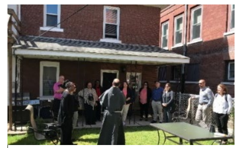
Figure 3: IIC members visiting Shamokin, PA, to hear from community and faith leaders on efforts and needs to rebuild the city.

In FY 2019, EPA formed the Federal Interagency Interfaith Collaboration for Vulnerable Communities (IIC) to enhance federal support for interfaith collaborations to address the needs of vulnerable and underserved communities. The IIC is comprised of representatives of the U.S. Departments of Agriculture, Justice, Labor, Homeland Security, Interior/Fish and Wildlife Service, General Services Administration and EPA. This effort recognizes that oftentimes faith leaders and faith-based organizations serve an important role in underserved and overburdened communities and operates under the authority of two presidential executive orders - Faith and Opportunity Initiative 40 (FOI)