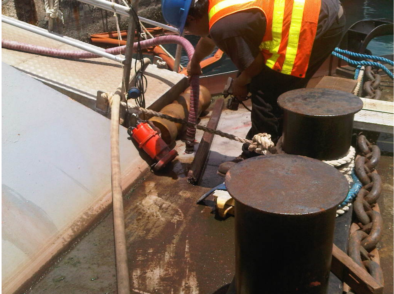
Sump and hose used to remove stormwater from deck of Dry Dock.