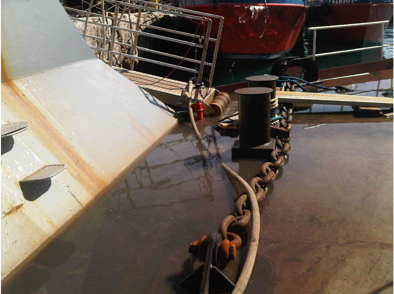
Stormwater collection on deck of Cabras Dry Dock.