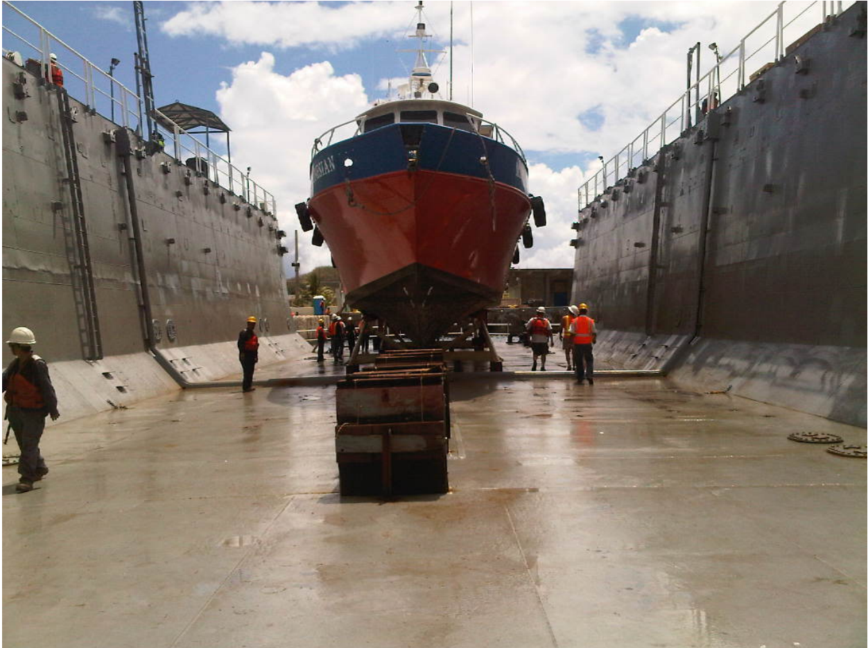
Close up of interior walls and flooring (May 2012)