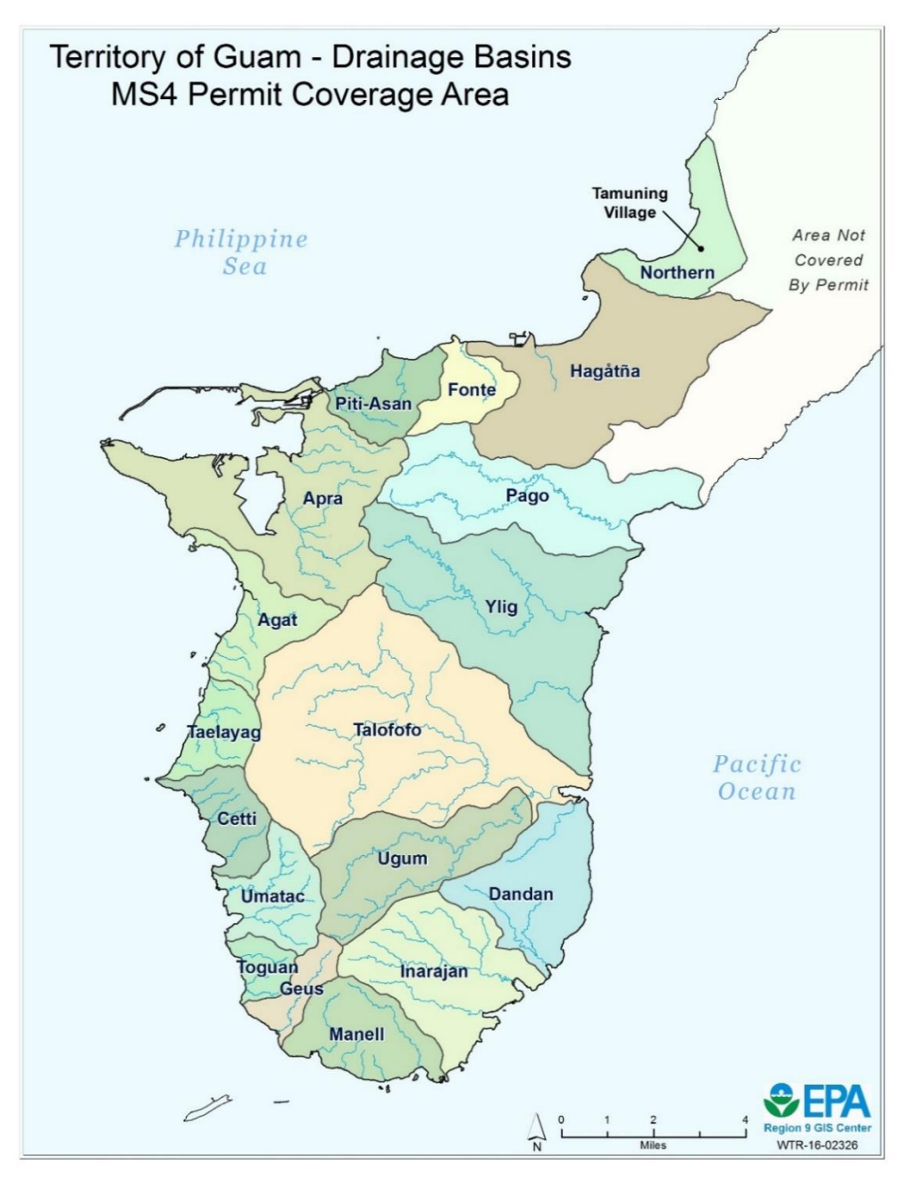
The DON MS4 permit area includes the following facilities (Naval Base Guam, Apra Heights, Nimitz Hill, Naval Magazine and Naval Hospital and adjacent high school), located in any of the following watersheds: Agat, Apra, Cetti, Dandan, Fonte, Geus, Hagåtña, Inaranjan, Mannell, Pago, Piti-Asan, Talayag, Talafolo, Toguan, Ugum, Umatac, and Ylig. In addition, the village limits of the village of Tamuming are included to the extent these limits extend northward beyond the boundaries of the Hagåtña watershed. The western tip of Navy Barrigada (shown in Appendix C) in the Hagåtña watershed is not covered.