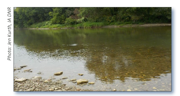
Figure 2. Mussel habitat has improved in the Upper Iowa River near Bluffton, Iowa.

triggered impairment of the river's aquatic life designated use. As a result, three segments of the Upper Iowa River were placed on Iowa's impaired waters list for sediment-siltation and nutrients in 2002. In the segment that was delisted in 2014, five species were found in 1984, while no live mussels were found in 1998.