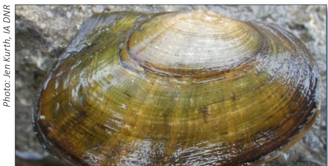
Figure 3. The threatened creek heelsplitter mussel has reappeared in the Upper Iowa River.

Concerns about water quality in Coldwater and Pine creeks, and as well as in the Upper Iowa River downstream, led to the formation of the watershed project in 2006, which was administered by the Winneshiek County Soil and Water Conservation District (SWCD) in Decorah. About 49 of 85 landowners in the watershed (57%) participated in the project by adopting conservation practices on their land. Popular practices included grassed waterways (80 acres), riparian filter strips (138 acres), sinkhole filter strips (35 acres), cover crops (343 acres), streambank protection (320 feet), riparian corridor fencing to exclude cattle from the streams (2.1 miles), and