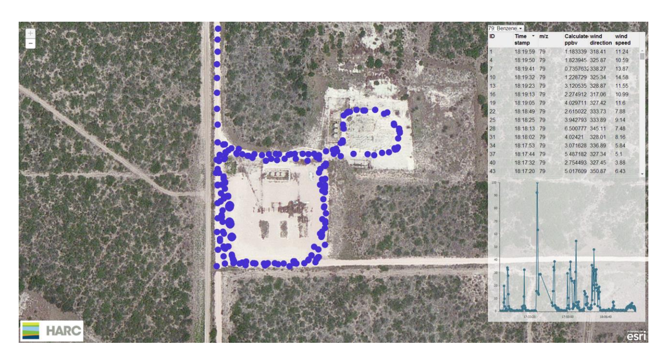
Figure 2. Hypothetical Web browser screenshot of the real-time data broadcasting system.