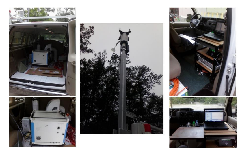
Figure 1 . Mobile laboratory to be used as the basis for the proposed system.

Lower left: PTR-MS Upper left: Van cargo section and roof-mounted GPS Center: Rotatable pole with sampling line and portable meteorological station Upper right: Driver's station Lower right: On-board computer and instrument operator's station.