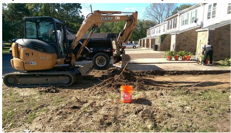
Excavation of soil in front yards as part of residential yard cleanup.

In June 2019, the Department of Justice (DOJ) <u>entered a CD</u> with the City of Philadelphia and its Redevelopment Authority to recoup $8.4 million of the remediation costs for the Lower Darby Creek Area Superfund Site. The settlement includes past costs (for the remedial investigation and feasibility study, design