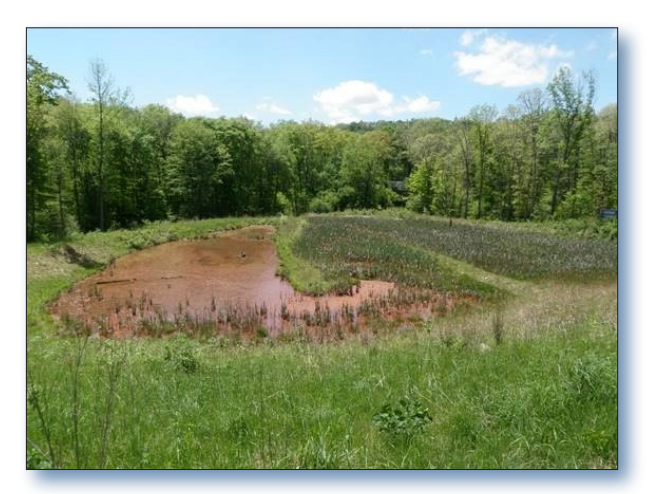
Figure 2. A settling pond and wetland were installed to address the BC16 AMD discharge site along an unnamed tributary to Blacks Creek.