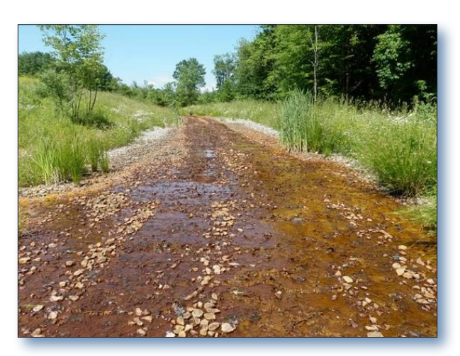
Figure 3. An oxidation precipitation channel (OPC) raises pH and removes iron from the water on a tributary that is downstream of the McIntire mine site.

SRI has built three systems that target the discharges ranked the highest based on total metal loadings. Monitoring data were collected at two TMDL points to show improvement due to restoration efforts (Table 1). The first TMDL sample point (BC2) point is downstream of two of the three constructed systems. Further downstream, TMDL point BC1 is located below all three passive treatment systems. There are a few more AMD discharges in the watershed that need to be addressed. However, the work that has been completed thus far has improved water quality and is a significant step towards reestablishing aquatic life in the Blacks Creek watershed.