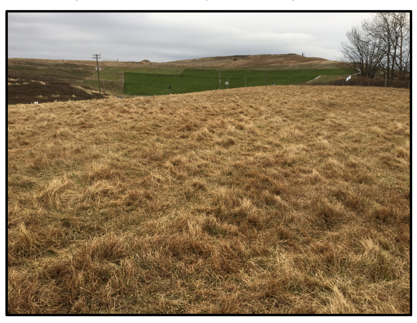
Picture 3: Top of Stablized Waste Landfill facing north towards Municipal Landfill Areas