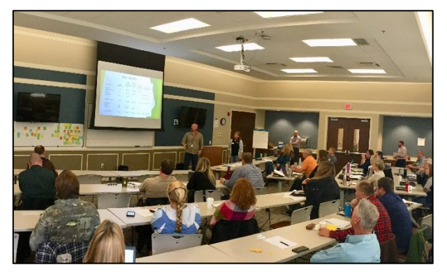
Big River Task Force Meeting - OCT 2018

The Big River Task Force (BRTF) is a multi-agency team that has agreed to come together to break down silos, communicate as a group, and work together to increase efficiencies and positive outcomes in the watershed. Led by the UW Ambassador, a BRTF meeting was held on 24-25 October 2018 in Farmington, Missouri. The BRTF is a meeting of State and Federal agencies with responsibilities for remediation and restoration in the Big River watershed. The purpose is to discuss cross-cutting issues from the standpoint of