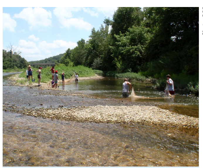
Students use nets to collect fish and macroinvertebrates in the Illinois River.

In 2010 NRCS began an Environmental Quality Incentives Program (EQIP) Special Initiative Project that invested more than $21 million in CPs in the Illinois River and neighboring Spavinaw Lake watersheds. This program helped to ensure consistent density of CPs on both sides of the state line.