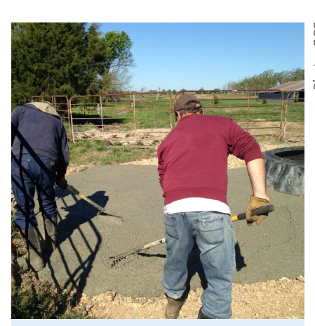
Landowners spread a concrete apron around an alternative watering tank.