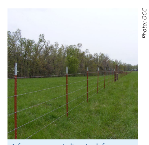
A fence prevents livestock from accessing a restored riparian area.