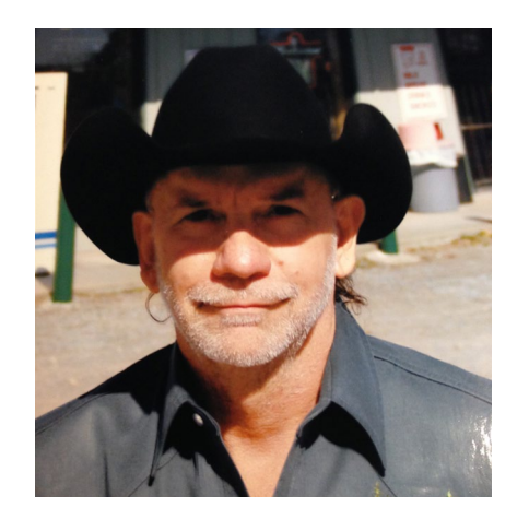
"My land and the river have done so well that I'd like my contracts to be extended indefinitely."