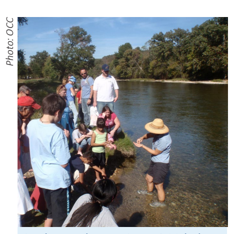
Students take part in an OCC-led Blue Thumb education event.