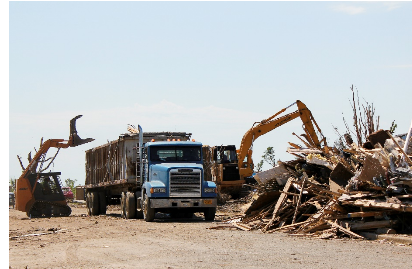
Debris removal after 2011 Joplin tornado

Collaborators: ORD (HSRP); Programs (OLEM ORCR & OEM); Regions (Disaster Recovery Coordinators, On-Scene Coordinators)