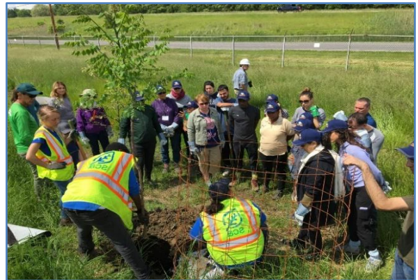
Wildlife Habitat Council works with the Student Conservation Association and industry employees to plant trees at Praxair, Burns Harbor as part of the USFS International Seminar on Urban Forestry.