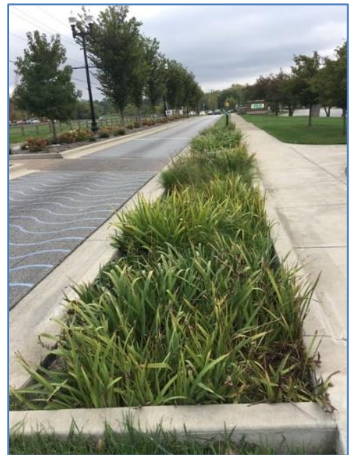
A rain garden installed in the City of Hobart.

Urban Waters will continue to support implementation of the Deep River Watershed Management Plan, installation of green infrastructure, and improved public access to Deep River as requested by partners. Urban Waters partners will support efforts to modify the Deep River dam following the recommendations of the feasibility study. Partners will seek funding for a priority canoe/kayak launch on Deep River in New Chicago. The City of Hobart will continue seeking funding for several projects including an outdoor learning center, a green infrastructure master plan, the annual Water Festival, an urban forestry inventory, wetland restoration, and other green infrastructure projects. Representatives from the City of Hobart will present on their green infrastructure installations at a 2020 Urban Waters partnership meeting. Delta Institute and the City of Hobart will continue their Chi-Cal Rivers-funded work to restore a tributary of Duck Creek and seek additional funds for future phases of the project.