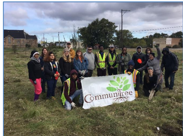
The Student Conservation Association Tree Team worked with Indiana University Northwest students to plant a food forest at the Brother's Keeper Community Garden in Gary.

Tree planting will continue through the Northwestern Indiana Regional Planning Commission's CommuniTree grants, the Student Conservation Association Calumet Tree Conservation Corps, and Wildlife Habitat Council. The Nature Conservancy will continue to inventory trees in parks in Gary. New in 2020, The Nature Conservancy will partner with the City of Gary and USFS on a pilot project to manage emerald ash borer die-off to reduce public safety risks while improving overall tree diversification and public perception of parks.