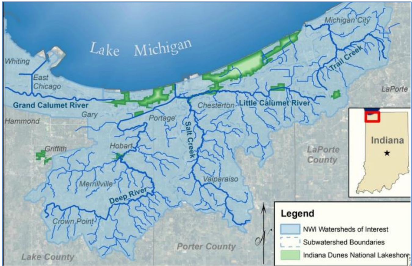
Map of Northwest Indiana Watersheds covered by the Urban Waters partnership.

Efforts to protect and improve individual Lake Michigan tributaries in Northwest Indiana are generally led by local watershed groups with Urban Waters performing a supporting role. For example, projects funded and conducted by US Army Corps of Engineers (USACE) and National Resource Conservation Service (NRCS) help achieve local watershed goals and U. S. Geological Survey (USGS) monitoring provides valuable data to watershed managers. USGS continued watershed-wide water temperature monitoring to enhance recreational information and thermal prediction capabilities in the Little Calumet River and Trail Creek Basins using USGS Urban Waters funding.