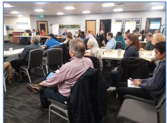
Attendance at NWI Urban Waters quarterly meetings continued to grow in 2019.

The Ambassador compiled and distributed a monthly e-newsletter (plus special alerts as needed). The subscriber list grew to 479. The full partnership met quarterly, and the federal partners held their annual meeting. Partner meeting attendance continued to grow with more than 40 partners consistently attending. NRCS representatives attended several partnership meetings, fulfilling a need for more NRCS engagement long-referenced by local partners. Several partners participated in regular Urban Waters national calls. Urban Waters convened one meeting of the university conservation partners work group.