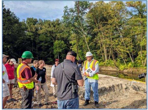
TCWP partners tour remediation underway at the Karwick Nature Park with Michigan City Sanitary District.

The Michigan City Sanitary District completed substantial remediation of a former unregulated dump along Trail Creek at Karwick Nature Park. The project includes installation of a leachate collection system, stabilization of eroding banks, capping, and revegetation. Michigan City continued working with partners to finalize plans for the adjacent Cheney Run wetland project. Michigan City completed a land acquisition strategy, which included Illinois-Indiana Sea Grant modelling of green infrastructure for the top parcels. Michigan City was awarded an USEPA Building Blocks technical assistance grant to implement a Green and Complete Streets tool.