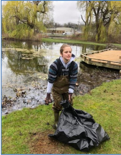
A Michigan City High School Wolves Environmental Restoration Team member removes invasive species along Trail Creek.

In 2019, many Urban Waters partners worked to secure funding for Wilderness Inquiry Wilderness Inquiry Canoemobile visits, coordinate logistics, and provide environmental education stations. 2019 Wilderness Inquiry visits were funded in part by NPS and the Five Star and Urban Waters grant program.