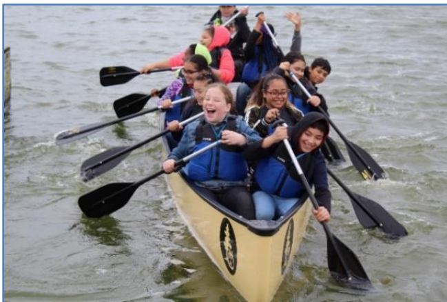
Students enjoy paddling as part of watershed education experiences, hosted by Dunes Learning Center, LaPorte County SWCD, and others.

Students practiced water safety while paddling 24' voyageur canoes and enjoying a unique outdoor team-building experience. To deliver this multi-faceted project over 21 school days, Dunes Learning Center worked with partner organizations that provided information on a wide range of environmental career pathways and leadership opportunities.