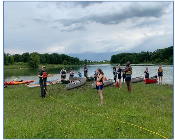
NWI partners participated in Paddlesports safety trainings hosted by Urban Waters and NPS.

Partners continued to implement Northwestern Indiana Regional Planning Commission's Greenways/Blueways Plan and increase access to waterways across NWI. Partners continue opening the Little Calumet River East Branch to paddling after decades of limited access. In 2019, partners installed an ADA-compliant canoe/kayak launch on the East Branch near Dunes Learning Center campus, and over 150 individuals attended the ribbon-cutting at celebration. The July NWI Urban Waters Partnership meeting featured discussion on accessibility along NWI waterways and natural areas. LMCP purchased a trail assessment system for assessing accessibility of trails and made it available on loan to land managers.