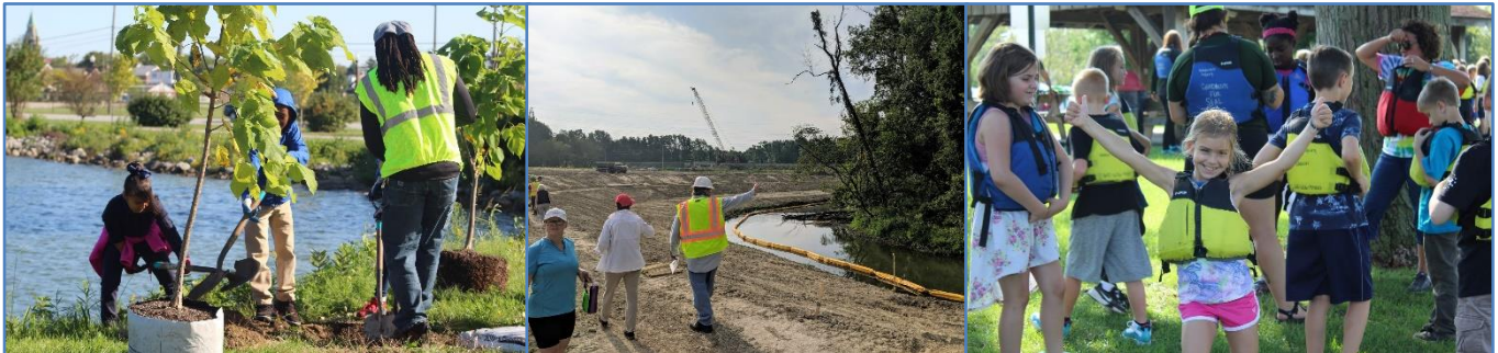
NWI Urban Waters partners are collaborating on a variety of initiatives to protect and restore local waterways.