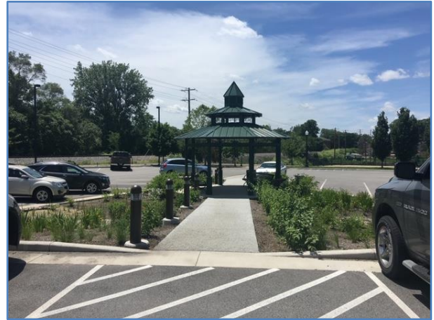
A new rain garden and pervious sidewalk installed at Hobart City Hall.