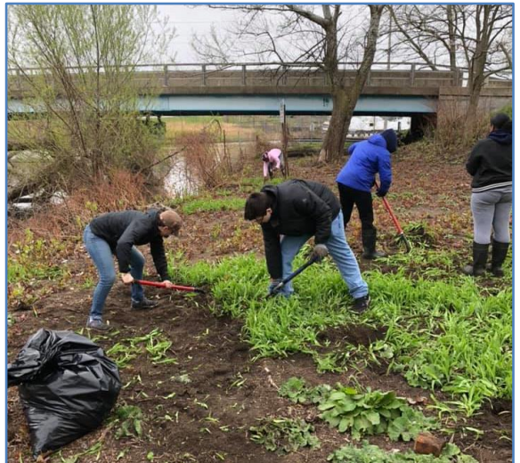
The MCHS Wolves Environmental Restoration Team removes invasive plants at Hansen Park.

Partners will continue to support implementation and update of the Trail Creek Watershed Management Plan and to participate in regular watershed partnership and stormwater advisory group meetings. Remediation at Karwick Nature Park will be completed. Construction of the Cheney Run wetland project will begin. Michigan City and partners will complete the Cheney Run Recreation Amenities Study. Urban Waters will work with Michigan City to implement the USEPA Building Blocks complete streets project. LaPorte County Parks will continue construction of a bioswale at Creek Ridge County Park. Urban Waters partners will continue to support Trail Creek Week and existing and expanded efforts of the MCHS Wolves Environmental Restoration Team as described under 'Watershed Education' above.