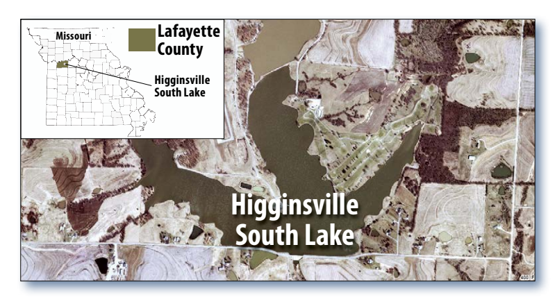
Figure 1. Higginsville South Lake is in Lafayette County in west-central Missouri.

State records indicate that elevated levels of atrazine existed in the lake beginning in 1994. Atrazine is commonly applied in Missouri on corn, sorghum and pastures to control broadleaf weeds. New atrazine label restrictions were added regarding application rates and required setbacks in 1993; however, atrazine continues to be used in Missouri. Atrazine is considered a human carcinogen and the state water quality standard for groundwater and drinking water supply is set at the maximum contaminant level (MCL) of 3 micrograms per liter (μg/L). Unlike many herbicides, atrazine is weakly adsorbed (attached) to soil particles and nearly all soils found in the Blackwater River watershed have moderate to severe potential for pesticide loss due to runoff or leaching. The local golf course was an additional source of the herbicide, where it was used to control broadleaf weeds. Runoff from the golf course flowed to Higginsville South Lake, increasing atrazine concentrations in the waterbody. According to Missouri Department of Natural Resources (DNR) data, in 1997 the lake contained atrazine concentrations of up to 6 \mu g/L. As a result, DNR added the Higginsville Lake South (segment (MO-7190-L) to the 1998 CWA section 303(d) list.