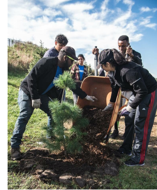
Volunteers plant a tree with SCA.

At each planting event, the SCA demonstrates proper tree planting techniques. Volunteers then help to plant, mulch, and water trees. All tools are provided, and plantings will take place rain or shine. Volunteers should wear long pants and closed-toe shoes and bring a water bottle to stay hydrated.