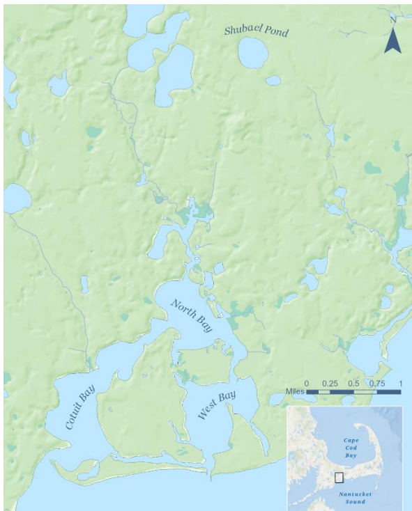
Map of the Three Bays Watershed in Barnstable County, Massachusetts