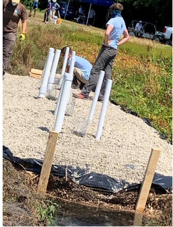
Completed bioreactor installation in Marstons Mills, Massachusetts in July 2020

Cranberry bogs are an iconic feature of the Cape Cod landscape. In the last twenty or so years, however, the reduced cost effectiveness of farming cranberries across southeastern Massachusetts and Connecticut has led many multigenerational farmers to consider retiring their farms and/or partnering with the state to restore them to wetlands. Past research has found that wetlands have the ability to use nitrate, and transform it to less harmful nitrogen gas, reducing the flow of nitrate to estuaries through nitrogen processing. In partnership with BCWC, EPA researchers are quantifying how retired or partially retired cranberry bogs can help address the Cape's nutrient problem. In December 2019, EPA co-organized a workshop with The Nature Conservancy and BCWC to bring together local stakeholders to discuss priorities and develop an action plan for the bogs in the headwaters of the Marstons Mills River. Two working groups were formed around the use of controlled flooding and woodchip bioreactors to decrease nitrogen in the bogs and reduce the nutrient load to the Marstons Mills River and the Three Bays estuary. Scientists have designed multiple options for the flooded wetland experiment, and plans are in the works for implementation. Changes in nitrogen processing due to the bioreactor will be measured and modeled in an experiment that began July 28, 2020.