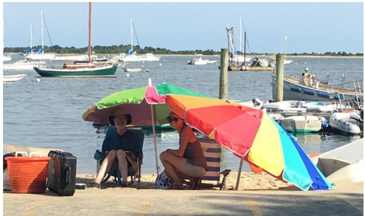
EPA researchers conducting counts of users of a coastal access point on Cape Cod for a past study

Since 2016, social scientists at EPA have been studying how improving water quality on Cape Cod affects the visitation and value of the recreation in coastal waters. The overall goals of this work are to quantify how many people are recreating on estuary waters and the value of improved water quality in the Three Bays Estuary and other estuaries and coastal waters on the Cape. Understanding the number of users and types of use (for example, kayaking or birdwatching) can help determine how many visitors are affected by water pollution on the Cape and how their valuation of recreation might change with improvements or degradations in water quality. These visitation estimates are also important in helping local planners and managers understand how people use the coast. Our team is using an innovative, straightforward observational method to build realistic estimates for visitation and types of recreational use in the Three Bays estuary system. EPA scientists are also using survey data to research the monetary value of improving water quality in New England. These results, when combined with the visitation estimates, will be useful for describing the impact of improved water quality in terms that are relatable for decision-makers and residents on Cape Cod.