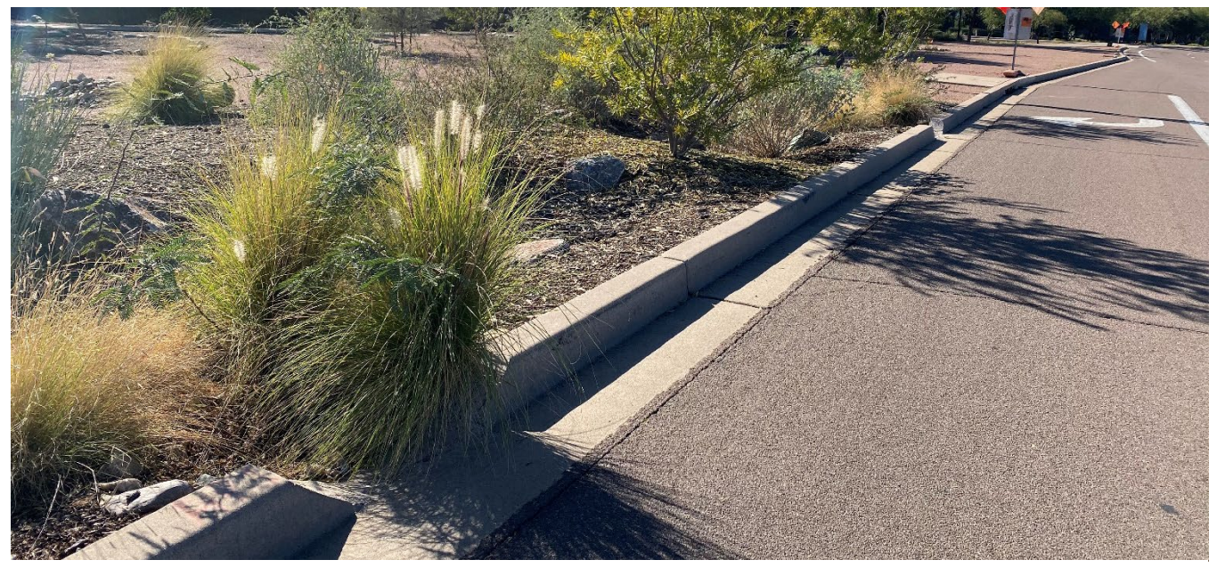
Example of local desert GI/LID installation with plantings suitable for arid and semi-arid climates.

Benefit Cost Analysis (BCA): Included almost $1M in environmental benefits. The FEMA BCA tool calculates the environmental benefits of turning land into a riparian area at $39,535/acre which was a competitive feature of this grant application. The total project area was about 27 acres of which 90% would be converted into riparian land and the remaining 10% would become open space.