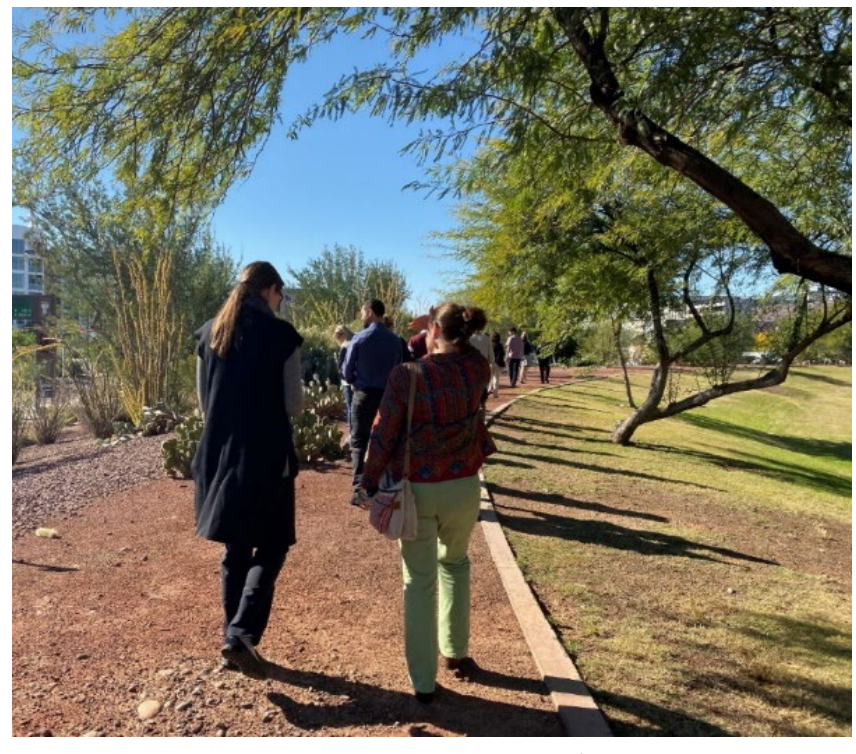
During the workshop, City of Tempe led a tour of a local desert GI/LID installation that provides multiple benefits including enhanced pedestrian safety and amenities, including canopy shade and pedestrian-scale cooling.