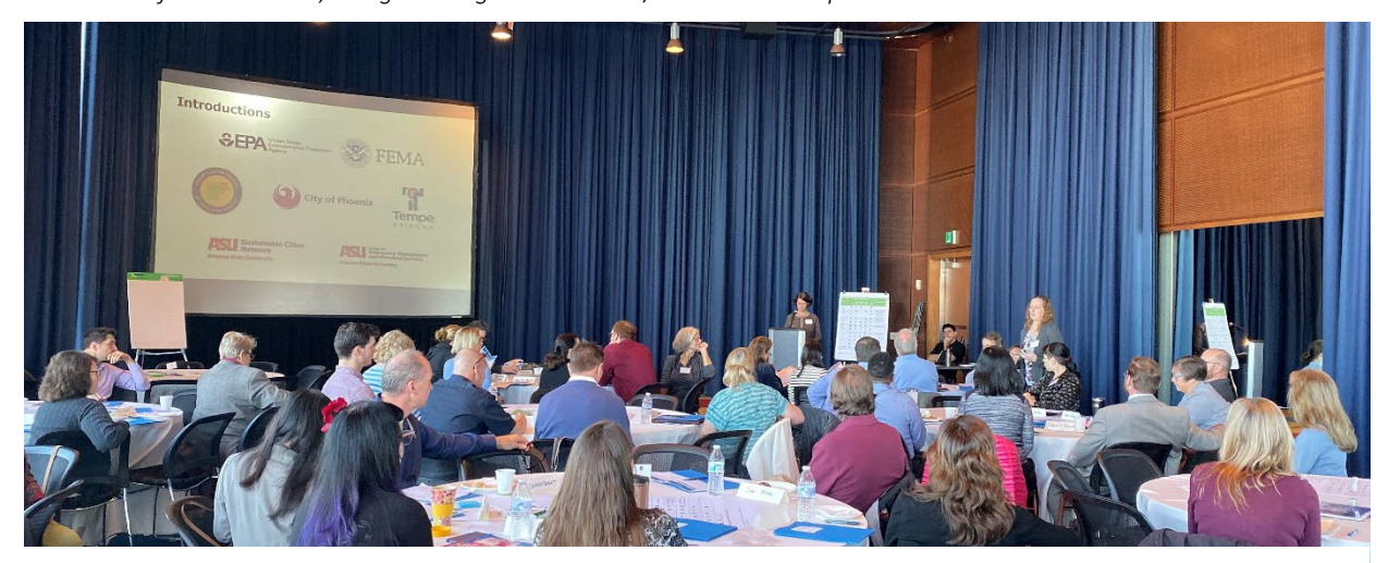
Nearly sixty representatives from federal, state, and local government, ASU and partner organizations gathered on December 10 and 11 to develop recommendations for integrating GI/LID into local and regional hazard mitigation planning.

BCA: Environmental benefits accounted for in the BCA include improvement of riparian habitat to support reintroduction of Rio Grande Cutthroat Trout, resiliency to variable events through flood and drought mitigation, hazardous fuel reduction, mitigation against erosion /sediment transport.