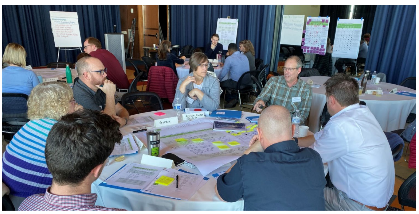
Workshop participants developed and prioritized GI/LID recommendations to consider during in the 2020 Maricopa County Multi-jurisdictional Hazard Mitigation Update process.

GI/LID technologies preserve and incorporate natural features into the larger land use and site design to achieve multiple stormwater and other co-benefits. Natural features include existing native landscape or constructed systems using grading, a range of soil media and plant materials. GI/LID technologies are especially effective in addressing drought, extreme heat and flood in arid climates. GI/LID technologies can also provide additional cobenefits including improved water and air quality, lower carbon emissions, improved property values, enhanced pedestrian safety and amenities, and long-term cost savings.