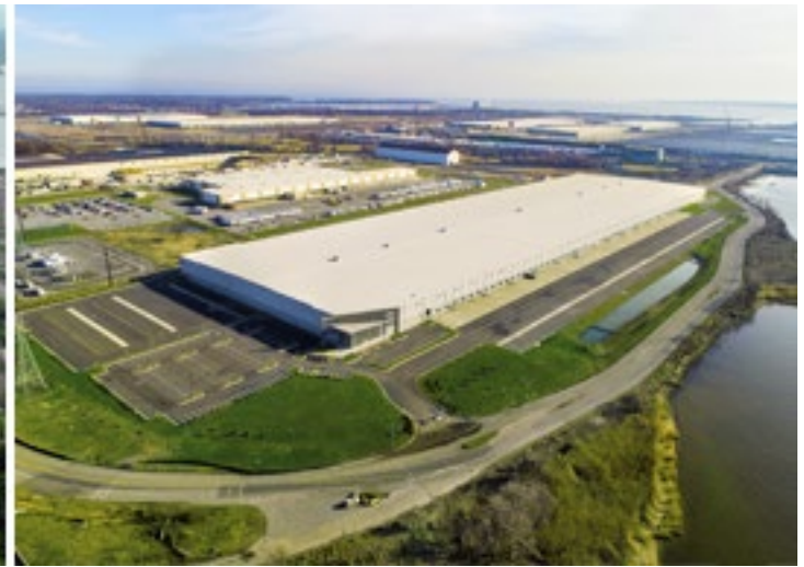
Before remediation (left) and after (right).

Baseline facilities currently of priority for the program, projections are that the program will meet by the end of 2020: