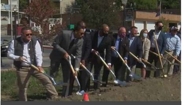
Officials break ground on The Steel Works Development on October 7<sup>th</sup>, 2020. The first retail tenant will open their doors by year end.

"This is what economic development is about. Giving people a reason to come to Steelton Borough and enticing them to stay."