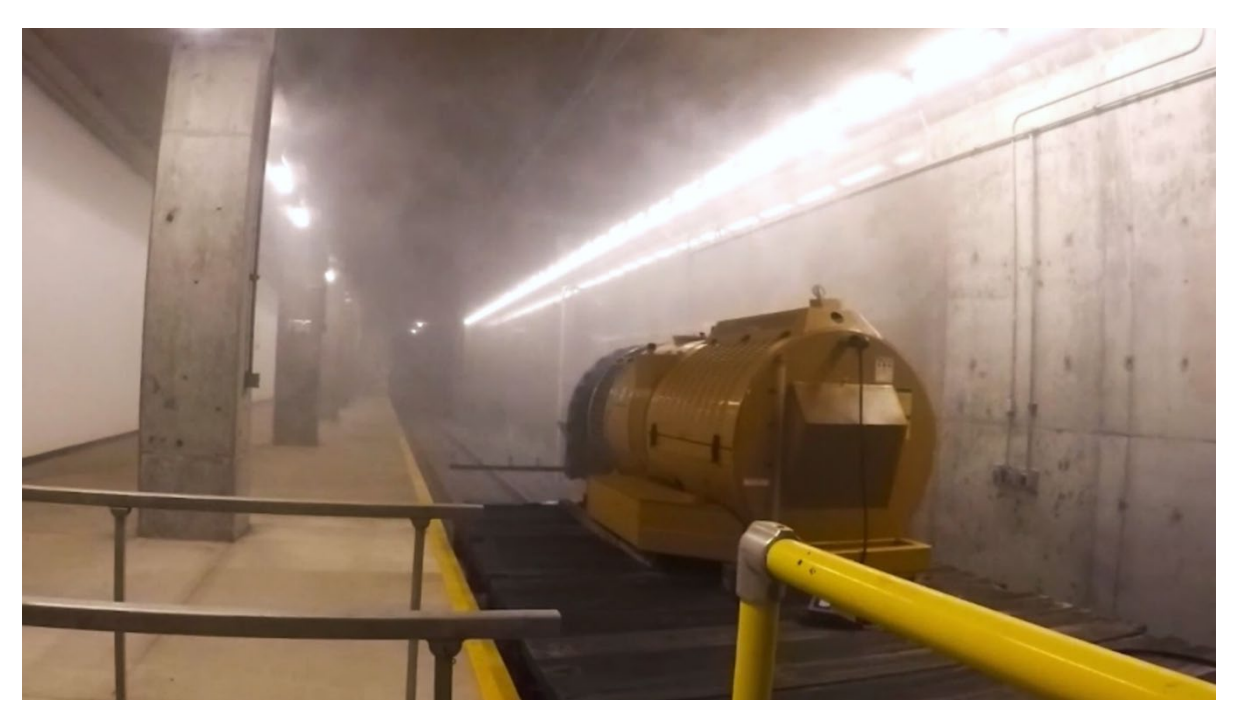
Figure 3: Demonstration of the use of an orchard air blast sprayer for the decontamination of a subway station during an operational technology demonstration