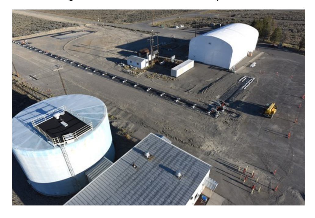
Figure 4: Aerial view of the Water Security Test Bed

Initial HSRP research efforts have focused on developing prototype decision-support tools for drinking water systems. HSRP will focus on expanding these tools to "all hazards", validating their results with real-world data, and using the tools in case study applications with partner drinking water utilities.