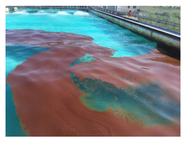
Figure 5: Photo of spill simulations using the Ohmsett wave tank facility at the Naval Weapons Station Earle in New Jersey (left panel) and laboratory evaluation of the performance of spill-treating agents (right panel).

ORD oil spill research includes experiments over large scales, such as spill simulations using wave tank facilities, like Ohmsett at the Naval Weapons Station Earle in New Jersey (Figure 5, left panel), and at small scales for evaluating the performance of spill-treating agents on the NCP Product Schedule (Figure 5, right panel).