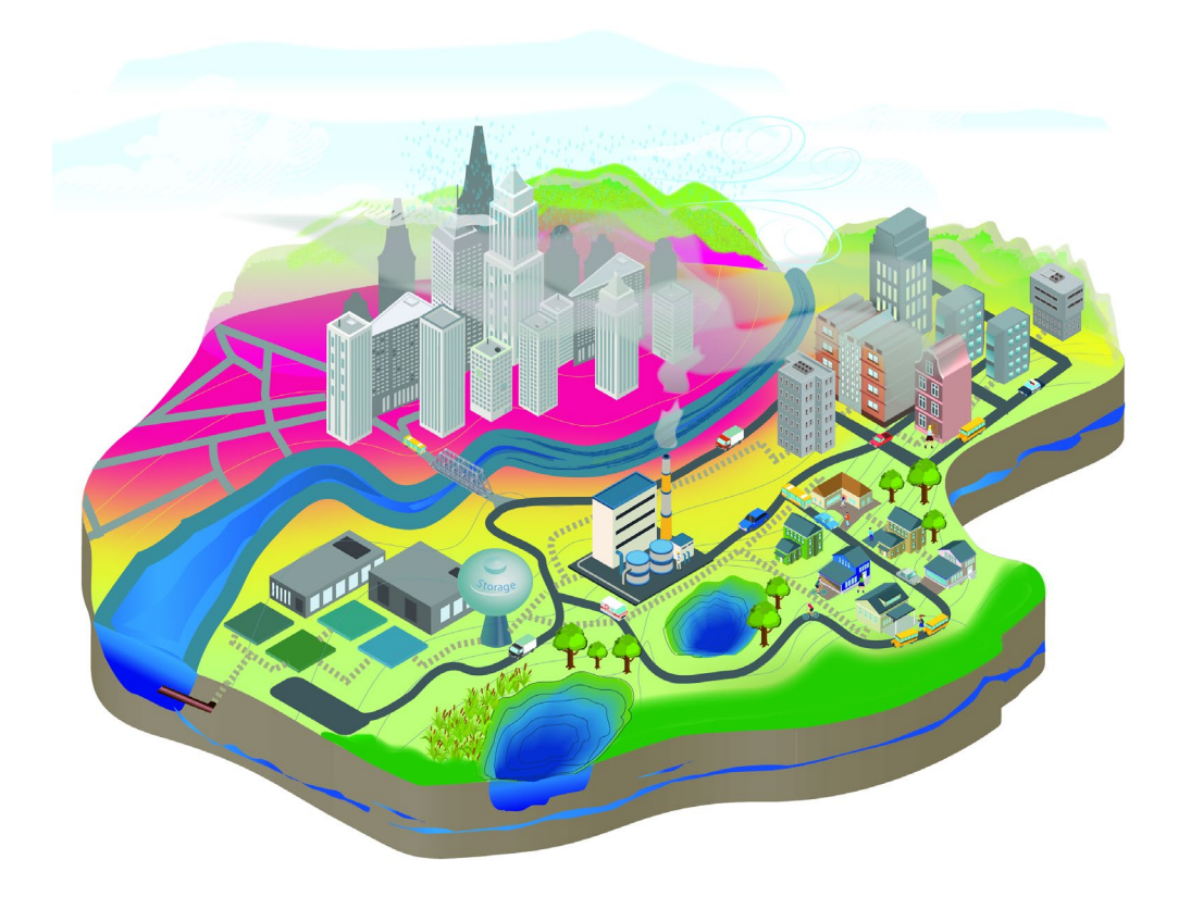
Figure 1: Schematic Overview of a Wide-Area and Water-System Contamination Incident for Scenario-Based Resilience Planning

A disaster that results in wide-spread chemical, biological, radiological, and nuclear (CBRN) contamination over a large outdoor area, or throughout a water and wastewater system, presents a daunting challenge to EPA, state, tribal and local responders in carrying out their responsibilities. Once released into the environment, contaminants can spread via natural forces and human activities. The potential for cross-media spread of contamination is depicted in Figure 1 and represents a sample of the complex scenario that large-scale contamination incidents present to communities.