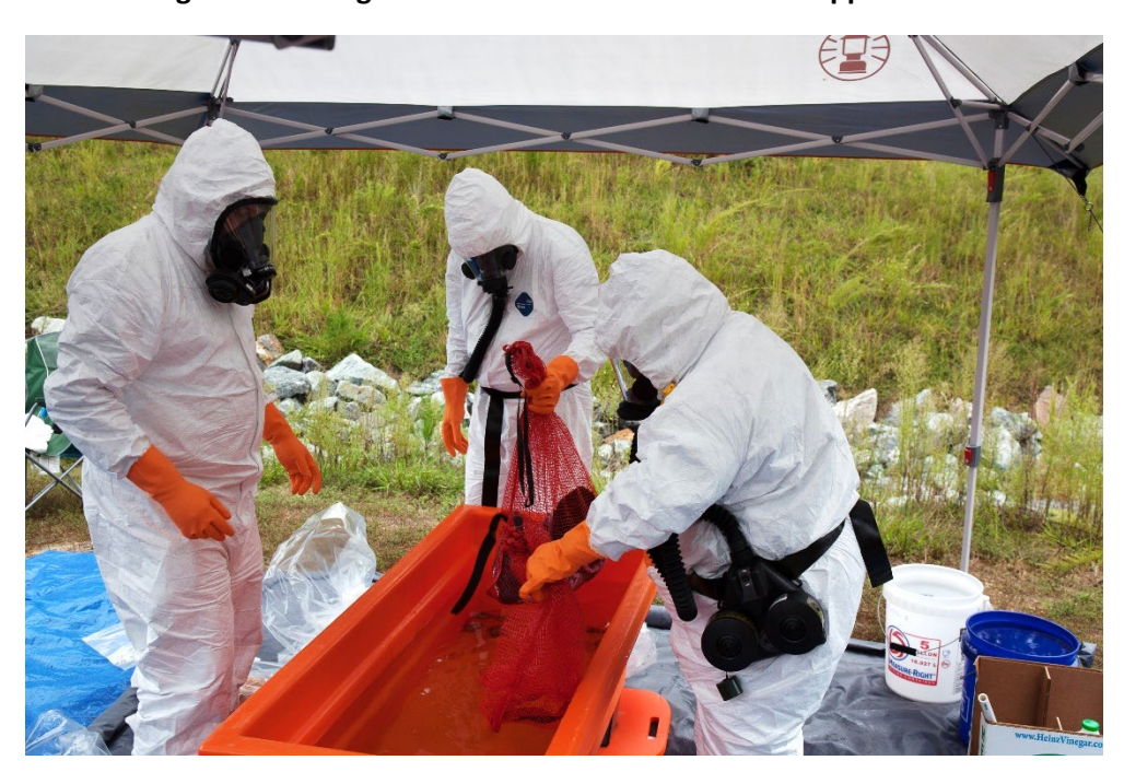
Figure 6: Testing of on-site solid waste treatment approaches.