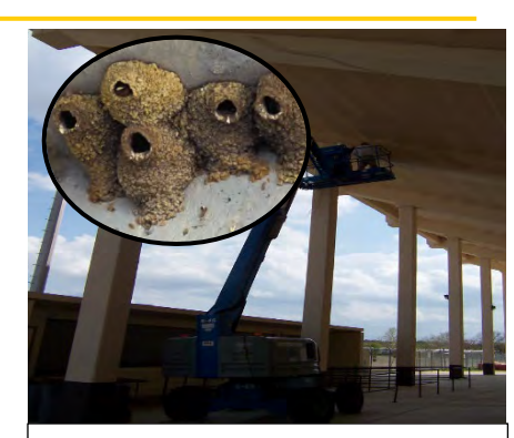
Cleaning and installing netting under the Killeen ISD stadium to deter thousands of roosting swallows.

problems, it replaced classroom carpet with tile, which is easier to clean. The change led to fewer pests and less pesticide use. Outdoors, roosting swallows created filth, especially under the sports bleachers and stadium. Cleaning and retrofitting of netting under these locations was required to deter thousands of birds. Ever resourceful, the district enlisted the support of local social services to resolve a student's unique bed bug challenge.