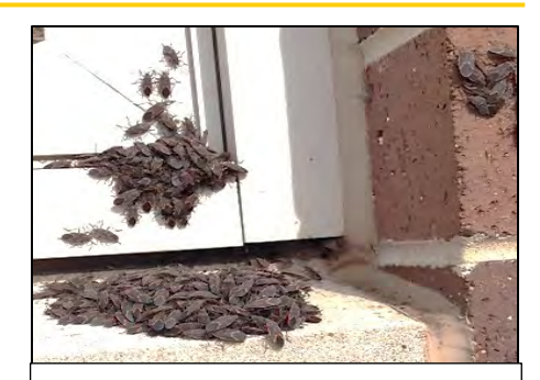
Boxelder bugs clinging to the outside of a classroom window were vacuumed off without the application of pesticides.

both mice and cockroaches are significant asthma triggers that can be reduced with IPM. Even with an effective IPM program in place, mice in older facilities are one of the more challenging pest issues. Ultimately, the district's maintenance staff followed mouse trails to find entry points, seal the holes, and close all other gaps in the building, significantly reducing mouse problems.