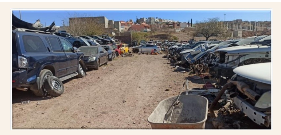
Junk vehicle site in Nogales, Sonora.

The government of Baja California is making efforts to minimize the adverse effects of the management of scrap tires generated in Baja California. The federal government, through the Secretary of Economy, authorizes the importation of 800,000 used tires from the United States to Baja California each year. In 2020, due to the effect of the COVID-19 pandemic, it was not possible to import the entire quota, however, the proliferation of tires that are not handled properly continues to be visible. It is estimated that for every tire imported legally, another may be imported informally or illegally. In recent years, only two companies have been authorized to handle tires properly, Cemex in Ensenada and Geocycle in Mexicali. The greatest uncertainty lies in the lack of financing for tire handling and processing infrastructure.