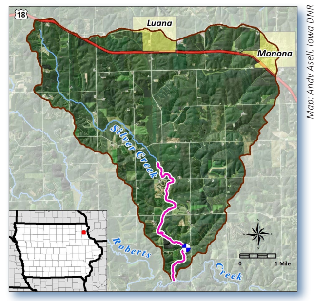
Figure 1. The Silver Creek watershed with biosampling site.

Sediment in waterways can completely bury or fill in gaps around many stream habitat types like rocks and gravel that are important to fish and benthic macroinvertebrate survival. This metric is also known as stream embeddedness, which is often evaluated in riffles or shallow runs where currents are normally high enough to prevent excessive fine sediment accumulation. As embeddedness increases, the large and small spaces between rocks become filled with