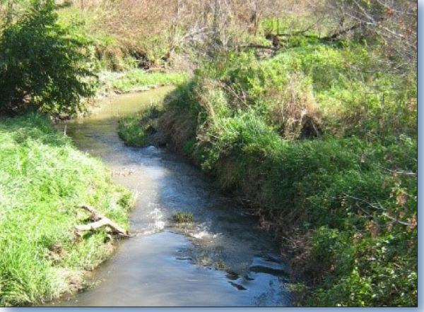
Figure 2. Silver Creek is in Clayton County.

The Silver Creek Watershed Project was funded and supported by Iowa DNR through U.S. Environmental Protection Agency CWA section 319 grants ($1,106,700) and the Clean Water State Revolving Fund ($410,000) and local landowners/farmers ($1,385,806). This money was used to leverage an additional $2,125,727 for the project. Other major project partners included the Clayton SWCD, the U.S. Department of Agriculture's Natural Resources Conservation Service and Farm Service Agency, and Iowa Department of Agriculture and Land Stewardship. Funding from all sources totaled $5,028,233.