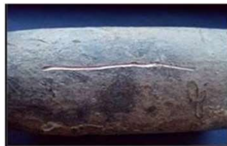
Picture of a Scratch on a Lead Service Line

Requirements addressing lead in water include specific provisions in: