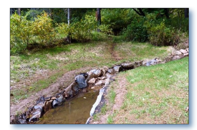
Figure 2. A DMS stream restoration site in an unnamed tributary to Bald Creek.

DWR conducted a special study on the Bald Creek watershed in 2016 to determine if fecal coliform concentrations were still elevated. The geometric mean of the five samples taken from each of the five sites in a 30-day period were below the state limit of 200 col/mL (Table 1). As a result, DWR removed every stream segment in the Bald Creek watershed from the CWA section 303(d) list in 2018, including 2.2-mile Fox Creek, 3.1-mile Elk Wallow Creek, 3.4-mile Lickskillet Branch, 3.4-mile Possumtrot Creek, along with Bald Creek. This means each segment is meeting state water quality standards for recreational use. Additionally, Elk Wallow Creek, Lickskillet Branch, and Possumtrot Creek are meeting their designated use as trout waters. Monitoring from 2003–2004 showed that the benthic and fish communities were meeting state standards for abundance and diversity, but many