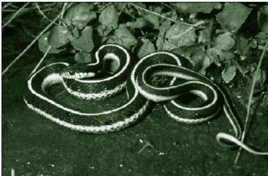
Garter Snake ( Thamnophis elegans ) - When disturbed, garter snakes will release an unpleasant smelling musk from glands located at the base of their tail.

Vernal pools, one type of ephemeral wetland, are of critical importance to amphibian populations. As small, often isolated wetlands, vernal pools are only wet for a portion of the year. Periodic drying creates a fish-free environment for amphibians, many of which have adapted rapid egg and larval stages as a race against the dry season. The absence of fish predators in vernal pools benefits amphibian populations.